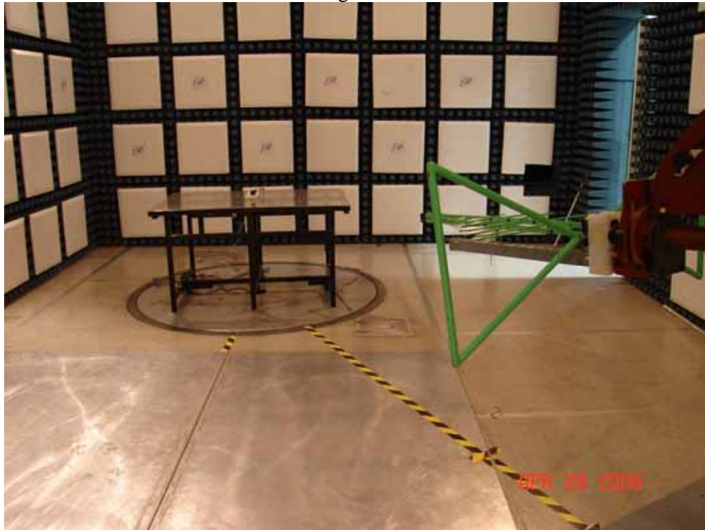
Test Setup for Radiated Emissions, 30MHz to 1GHz – Horizontal Polarization