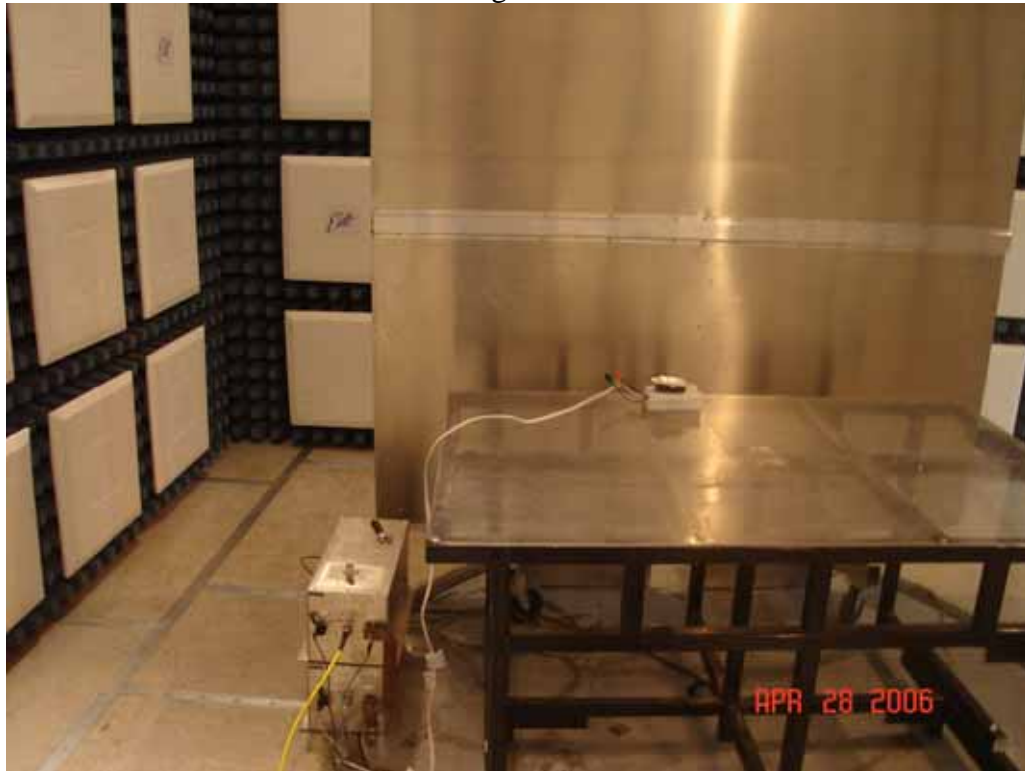
Test Setup for Conducted Emissions