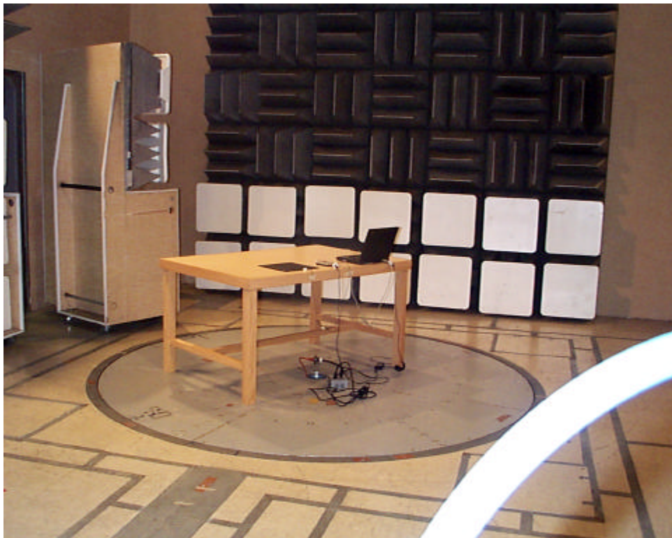
Bandwidth and Spurious Emissions