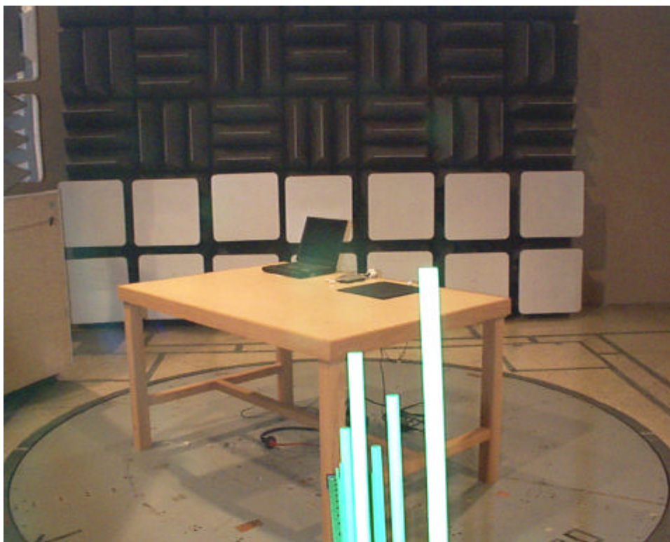
Radiated Emissions (30-1000 MHz)