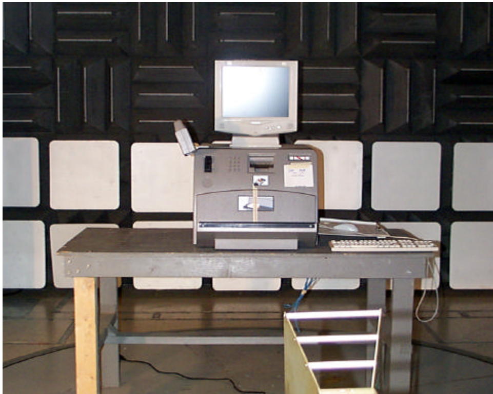
Radiated Emissions (1 to 2 GHz)