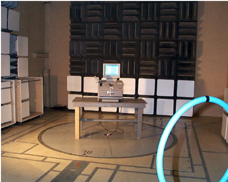
Emissions Bandwidth/Spurious Emissions