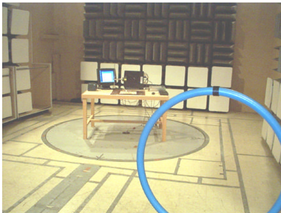
Bandwidth and Spurious Emissions