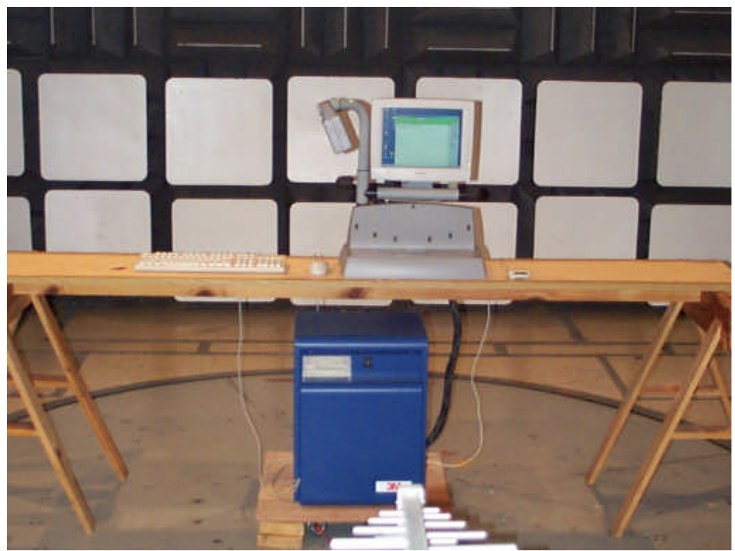
Radiated Emissions (30-1000 MHz)