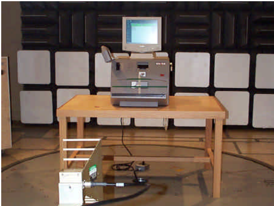
Radiated Emissions (1-5 GHz)