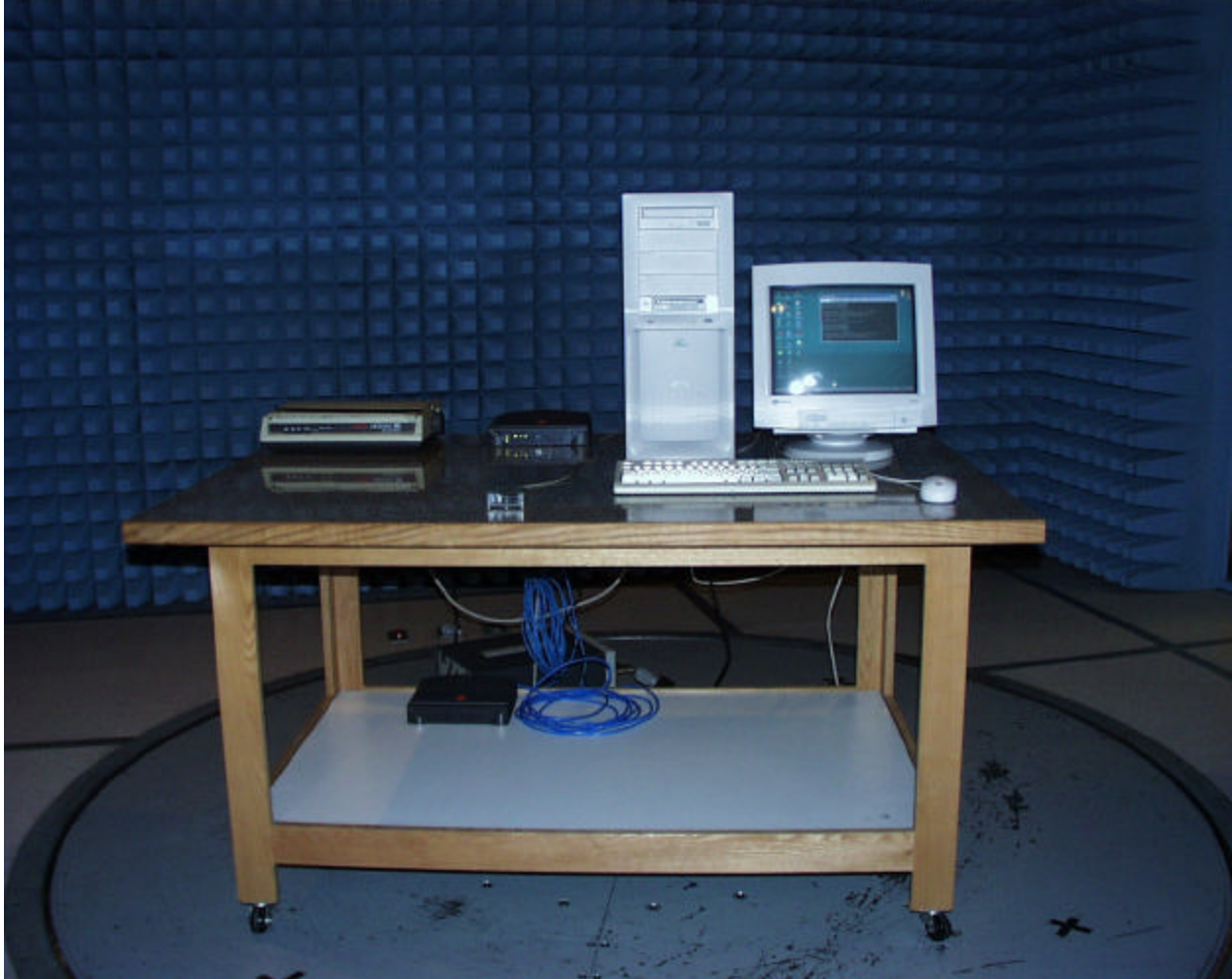
Front view worst case radiated emissions