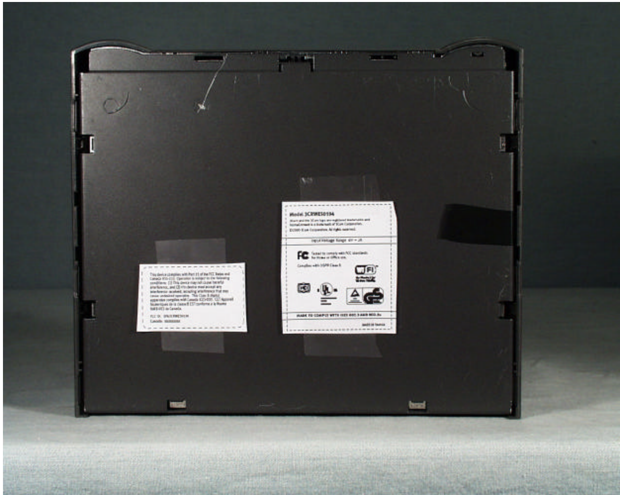
Photograph showing label placement