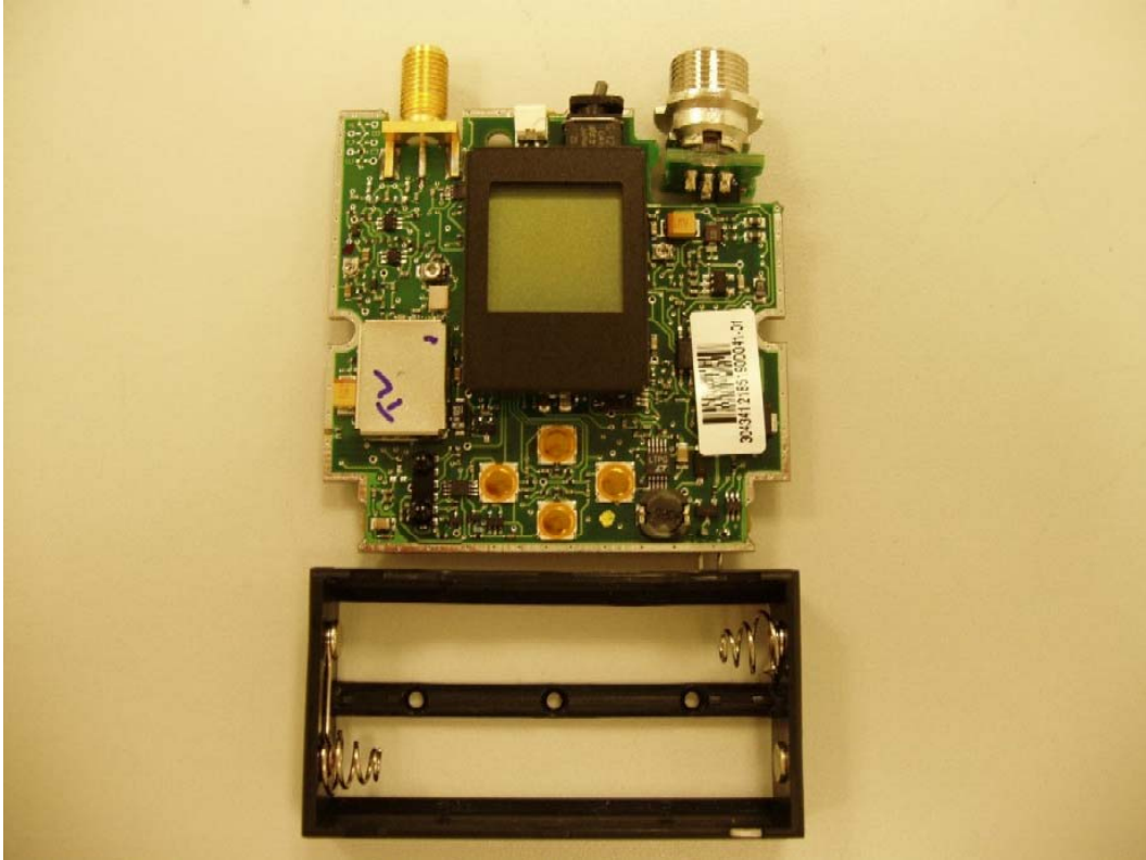
UR1A PCB Top