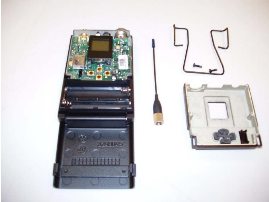
UR1A PCB Top in Case