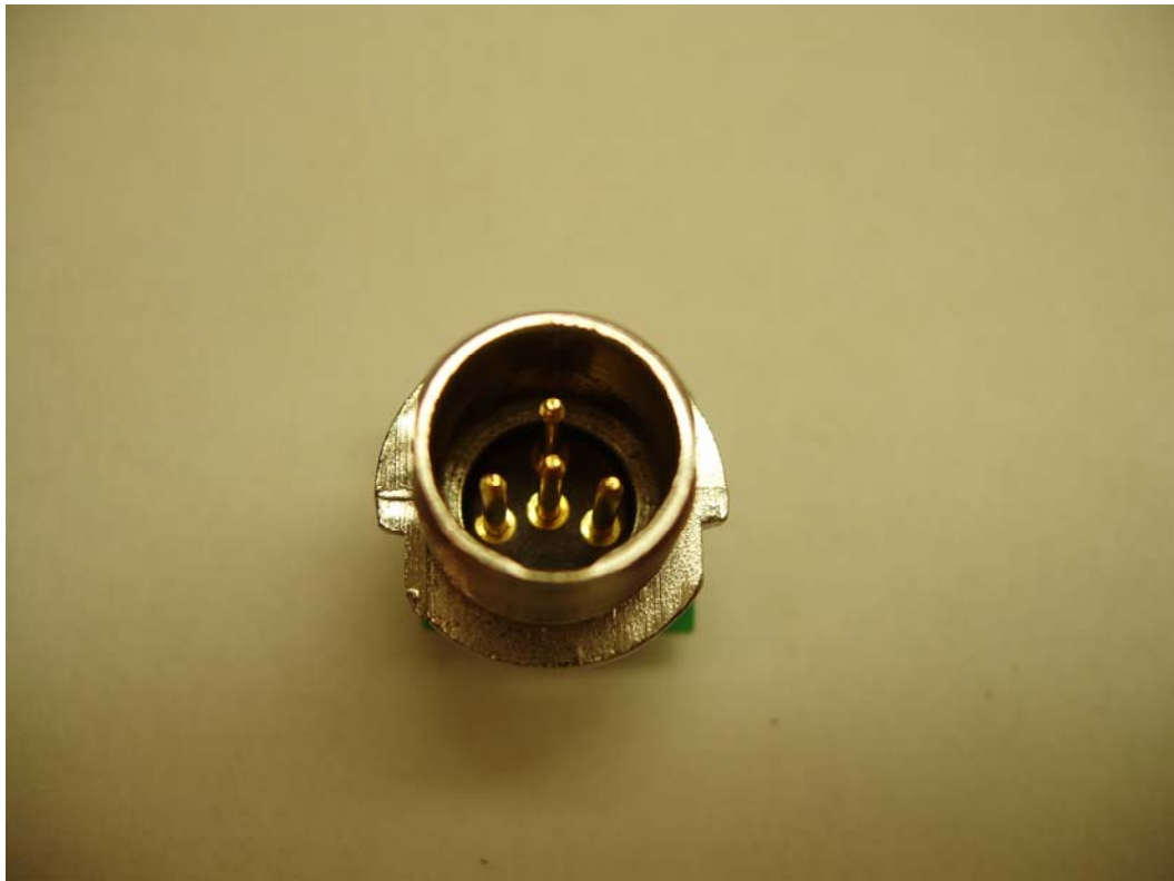
UR1A Microphone Connector PCB