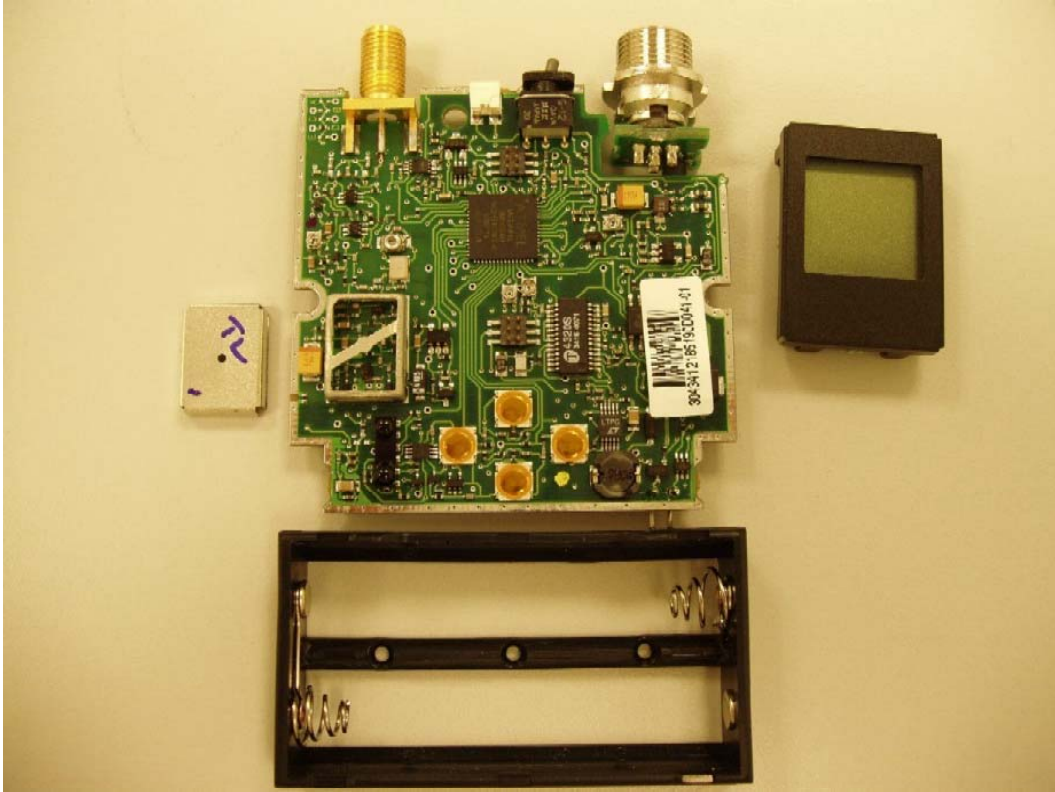
UR1A PCB Top without Shield