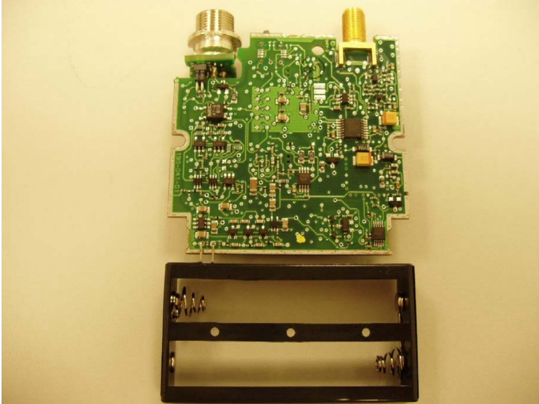
UR1A PCB Bottom