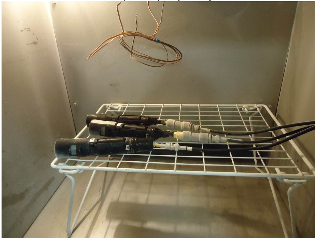
Test Setup for Frequency Stability Test