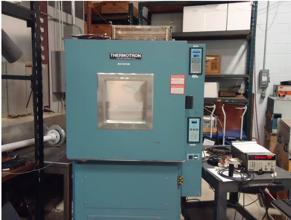
Test Setup for Frequency Stability Test