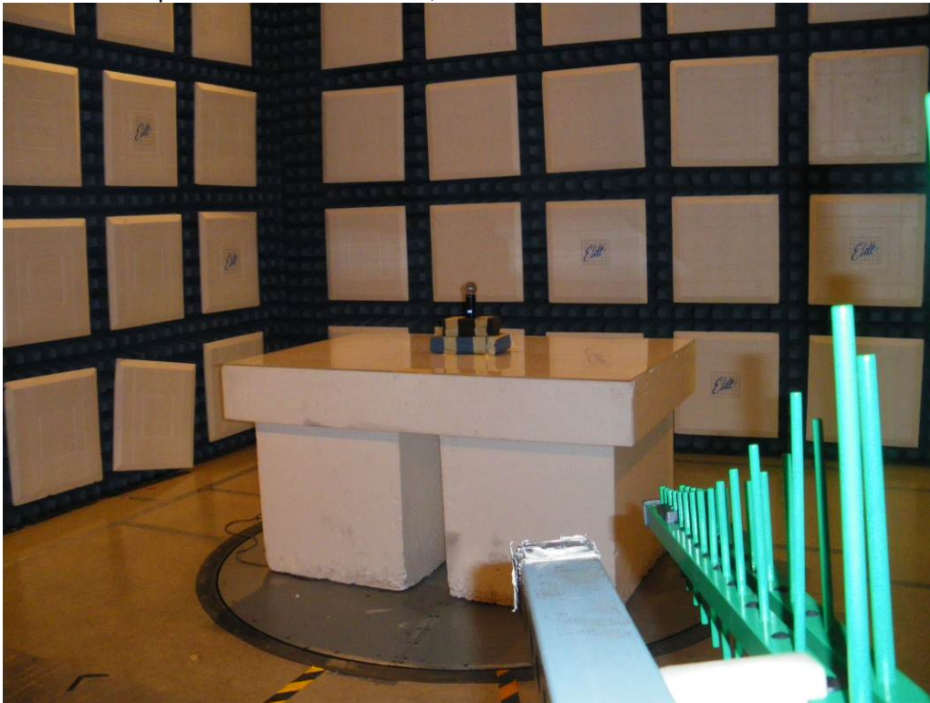
Test Setup for Radiated Emissions, 30MHz to 1GHz – Vertical Polarization