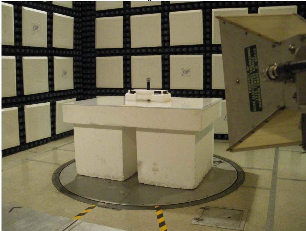
Test Setup for Radiated Emissions, Above 1GHz – Horizontal Polarization