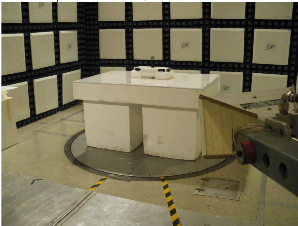
Test Setup for Radiated Emissions, Above 1GHz – Vertical Polarization