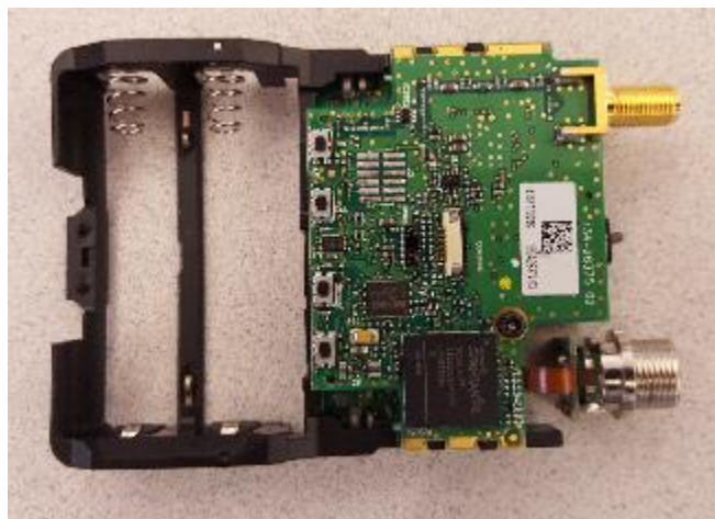
ULXD1 V50 Circuit Board Bottom