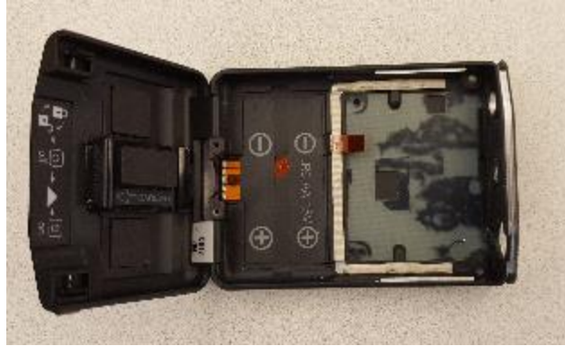
ULXD1 V50 Open Case, Circuit Board Removed