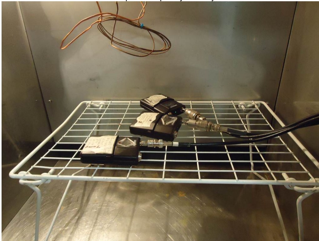
Test Setup for Frequency Stability Test