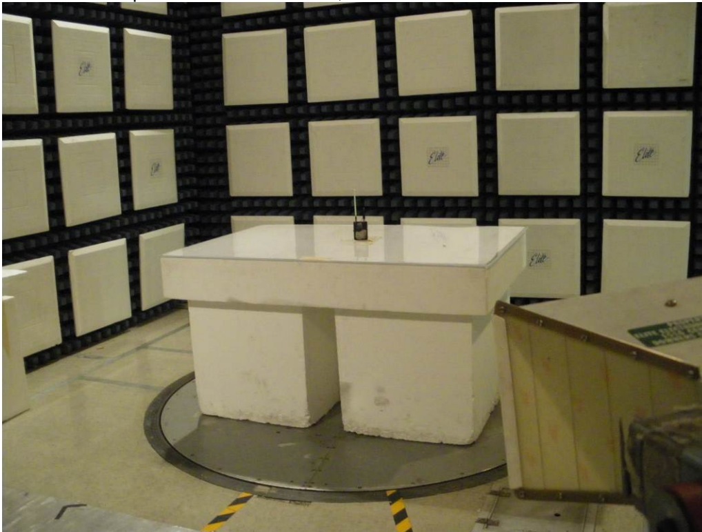
Test Setup for Radiated Emissions, Above 1GHz – Vertical Polarization