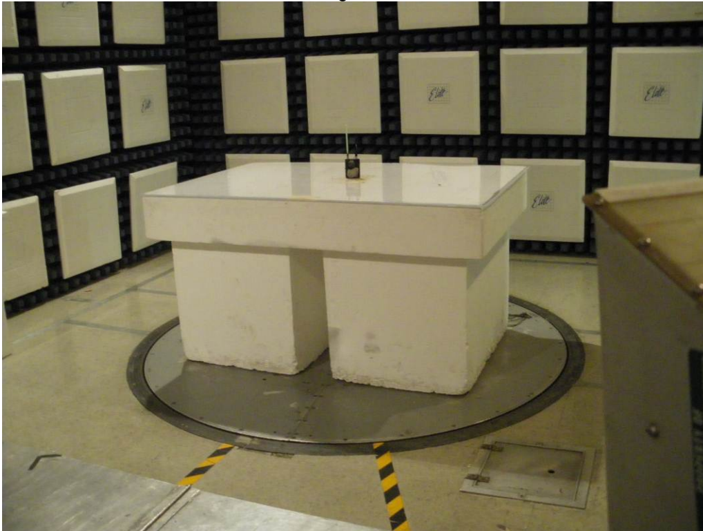
Test Setup for Radiated Emissions, Above 1GHz – Horizontal Polarization