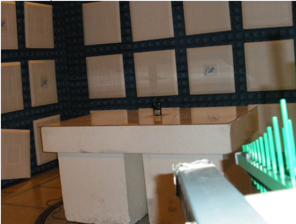
Test Setup for Radiated Emissions, 30MHz to 1GHz – Vertical Polarization