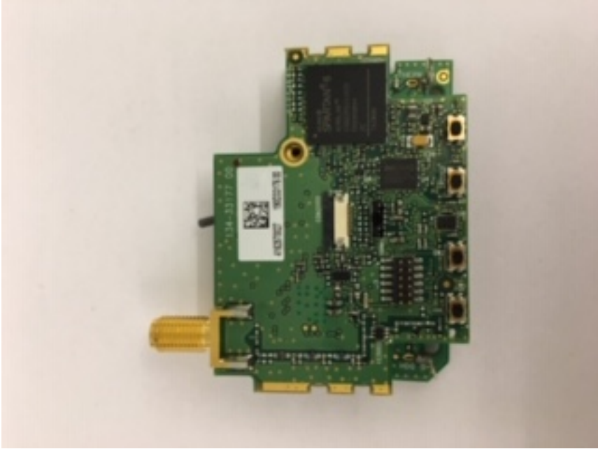
ULXD1 PCB Top