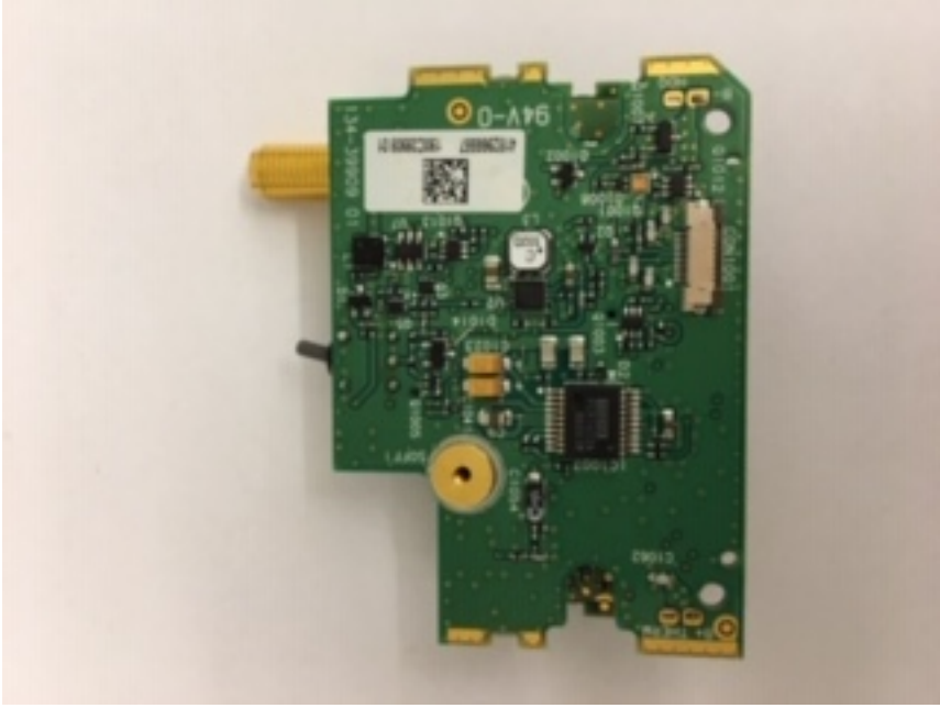
ULXD1 PCB Back