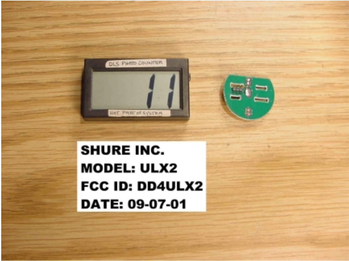
MICROPHONE CONTACT BOARD SIDE #2