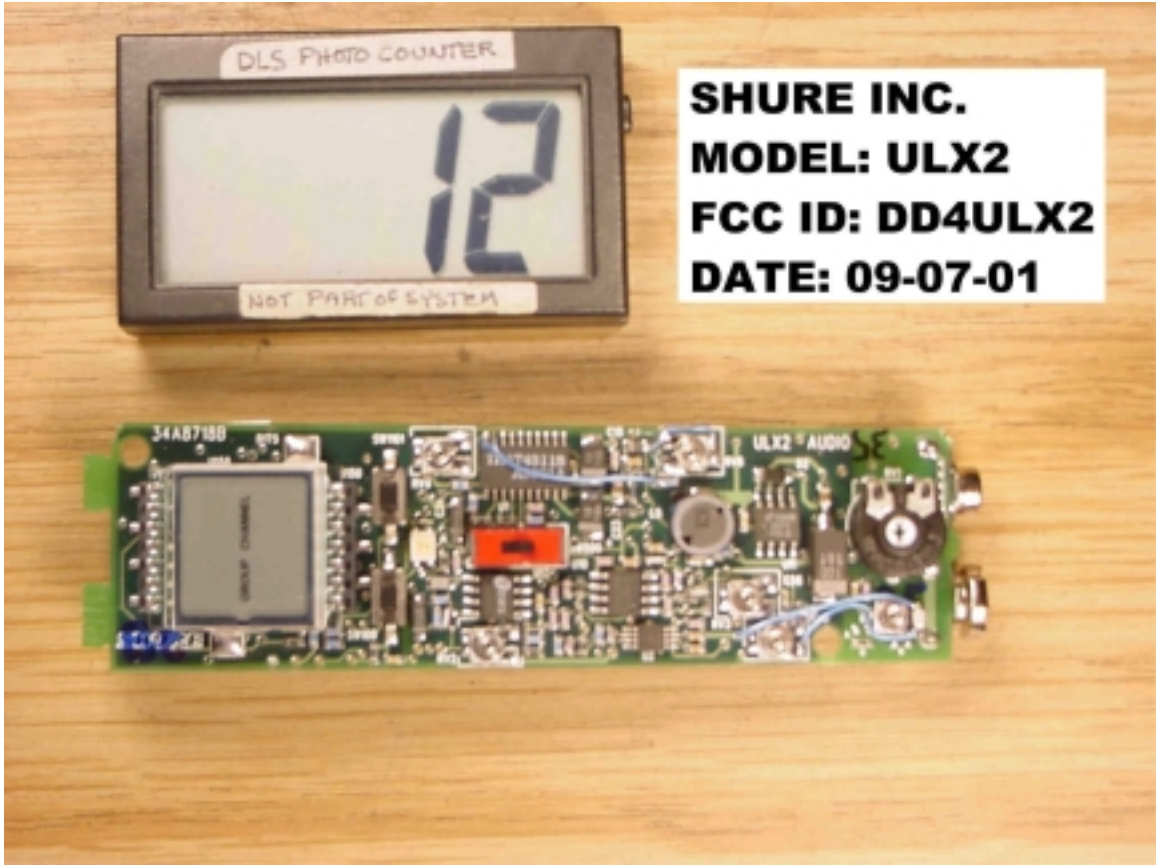
AUDIO CIRCUIT BOARD SIDE #1