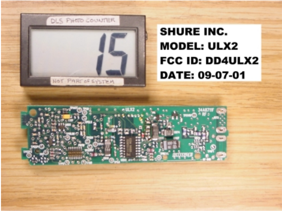
RF CIRCUIT BOARD SIDE #2