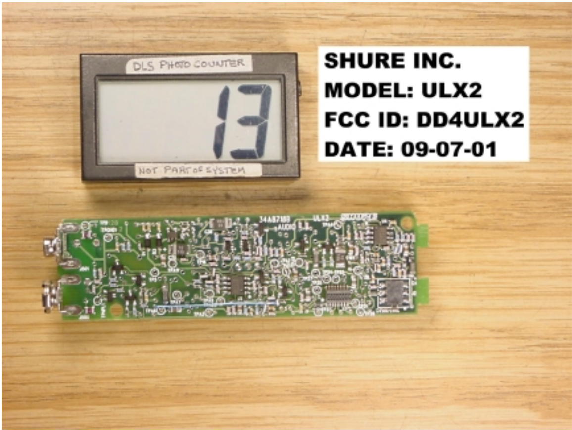
AUDIO CIRCUIT BOARD SIDE #2