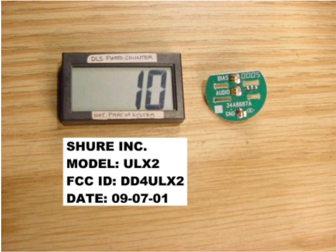
MICROPHONE CONTACT BOARD SIDE #1