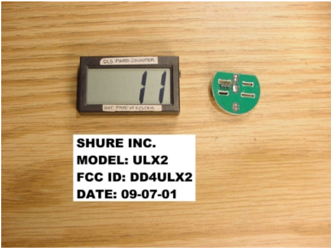
MICROPHONE CONTACT BOARD SIDE #2