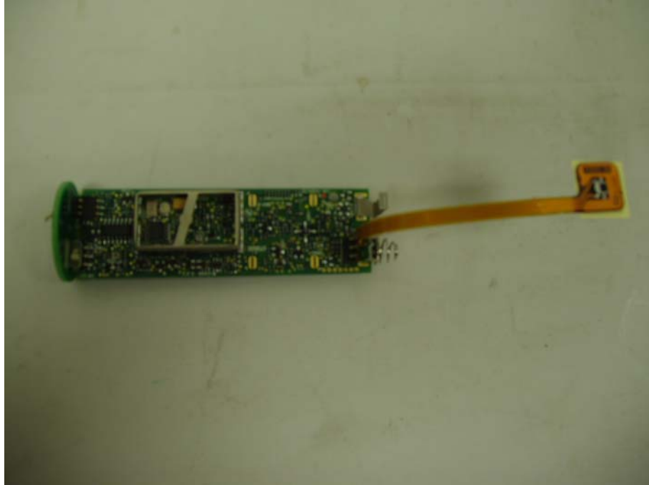
FP2 PCB Top