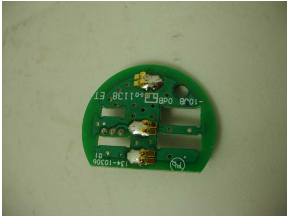
FP2 Audio Input - Top