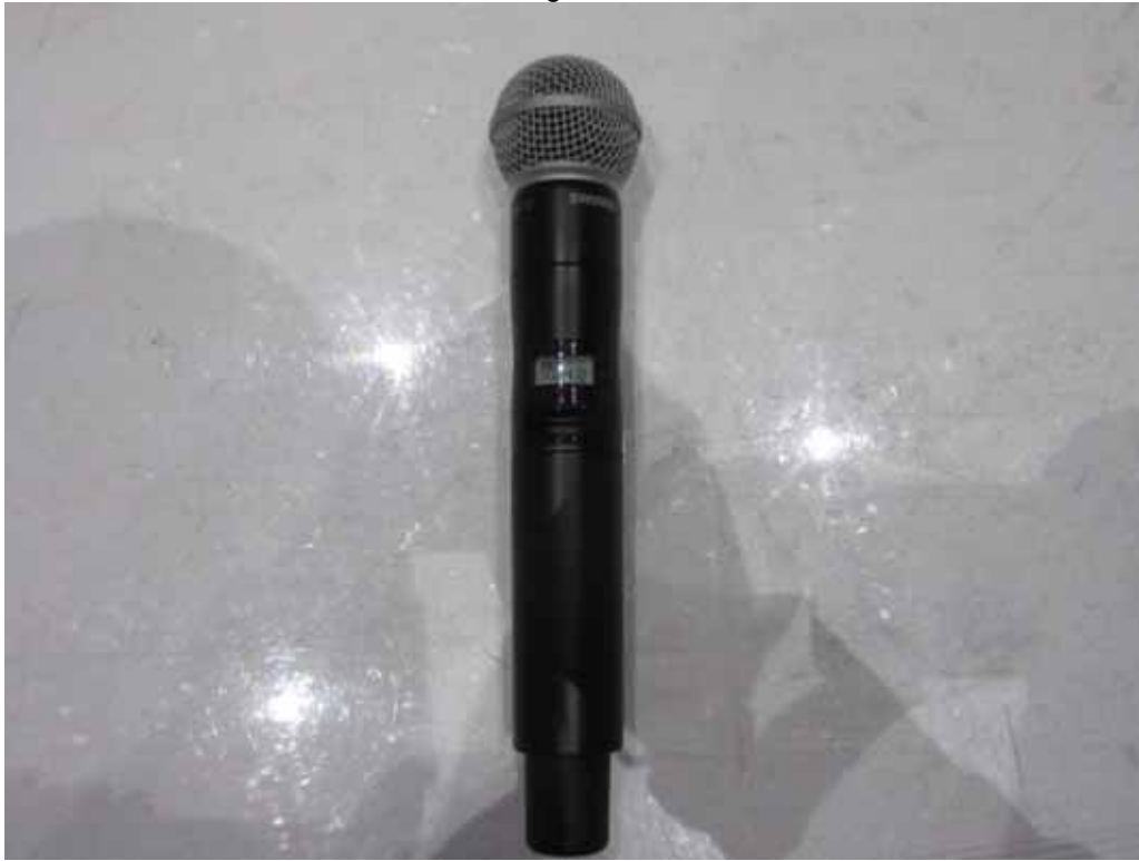
Photograph of the EUT