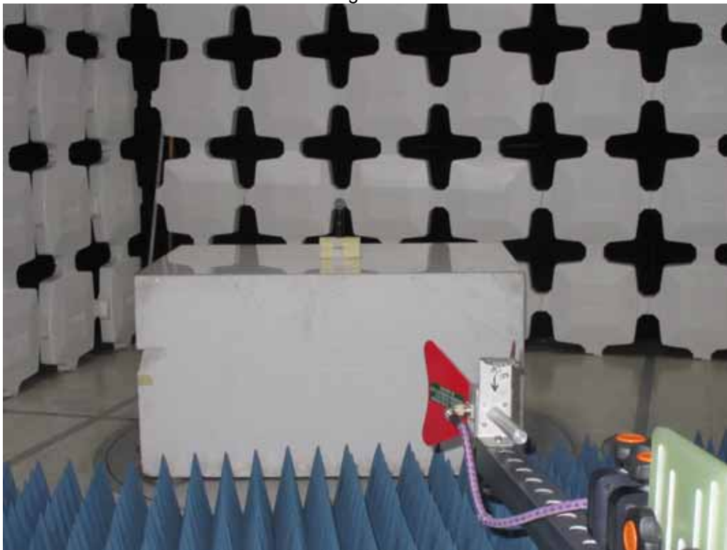
Test Setup for Radiated Emissions, 1GHz to 10GHz – Horizontal Polarization