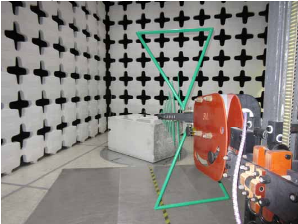
Test Setup for Radiated Emissions, 30MHz to 1GHz – Vertical Polarization