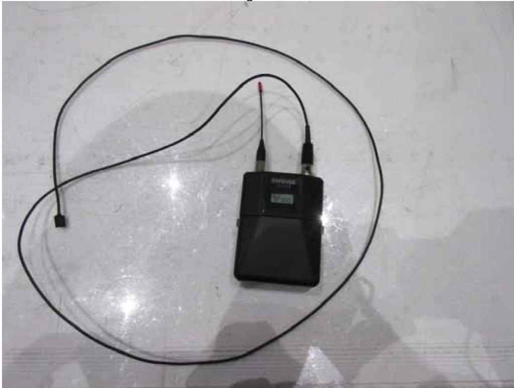
Photograph of EUT