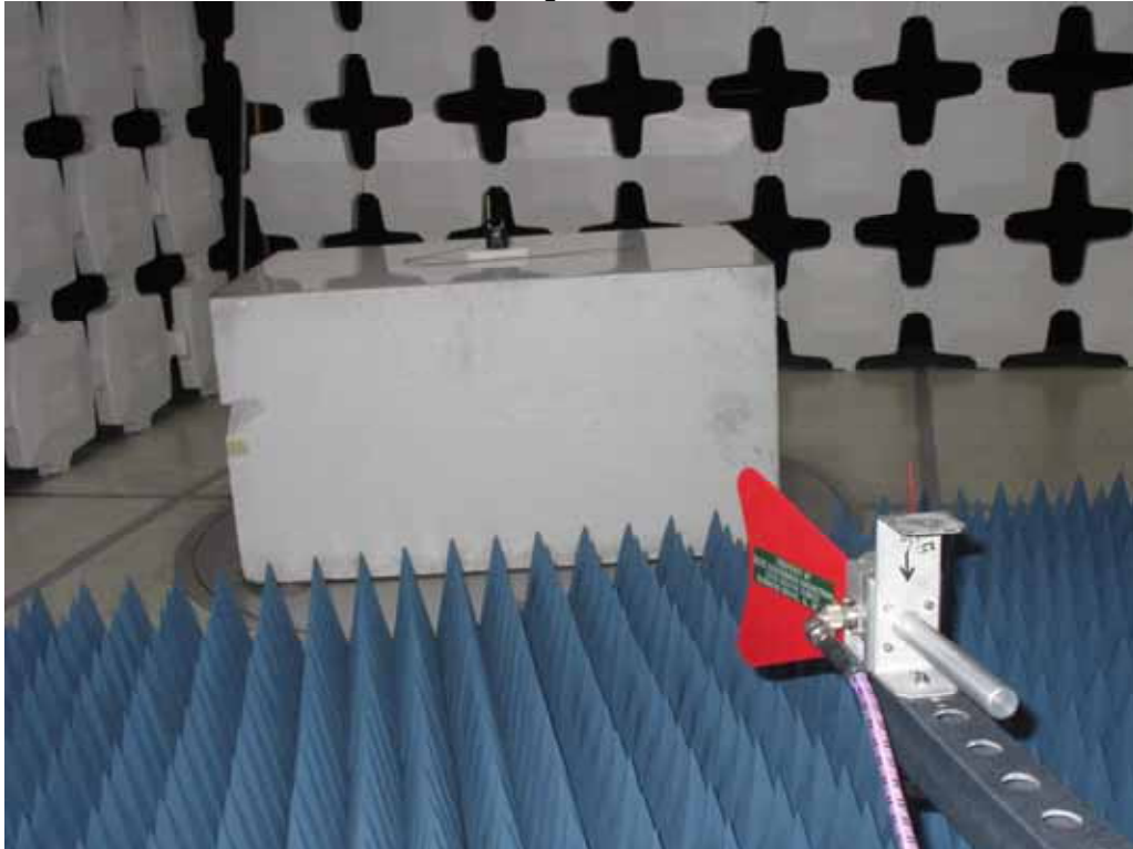
Test Setup for Radiated Emissions, 1GHz to 10GHz – Horizontal Polarization