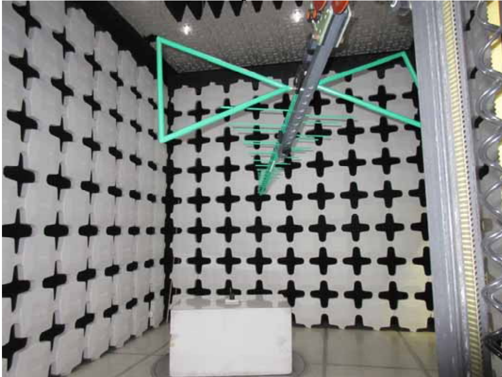
Test Setup for Radiated Emissions, 30MHz to 1GHz – Horizontal Polarization