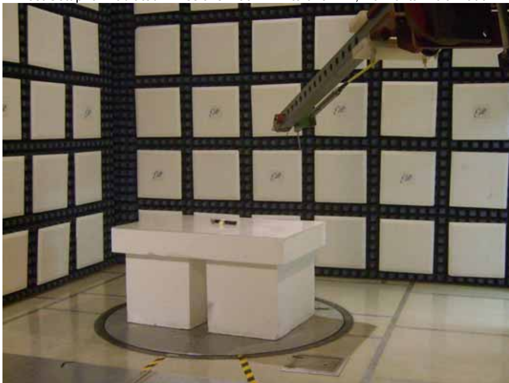
Test Setup for Radiated Emissions – 902MHz to 928MHz, Vertical Polarization