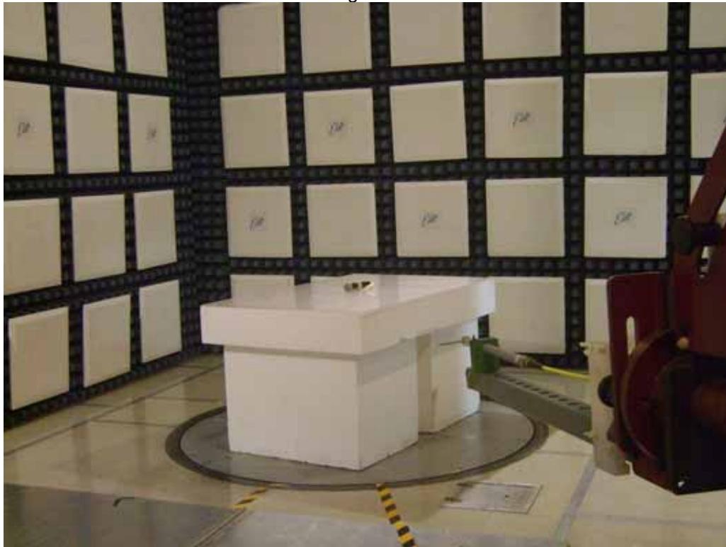
Test Setup for Radiated Emissions – 902MHz to 928MHz, Horizontal Polarization