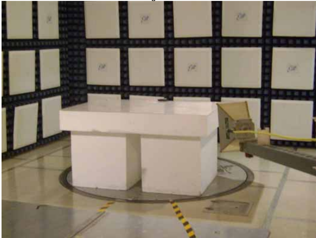
Test Setup for Radiated Emissions – 1GHz to 10GHz, Horizontal Polarization