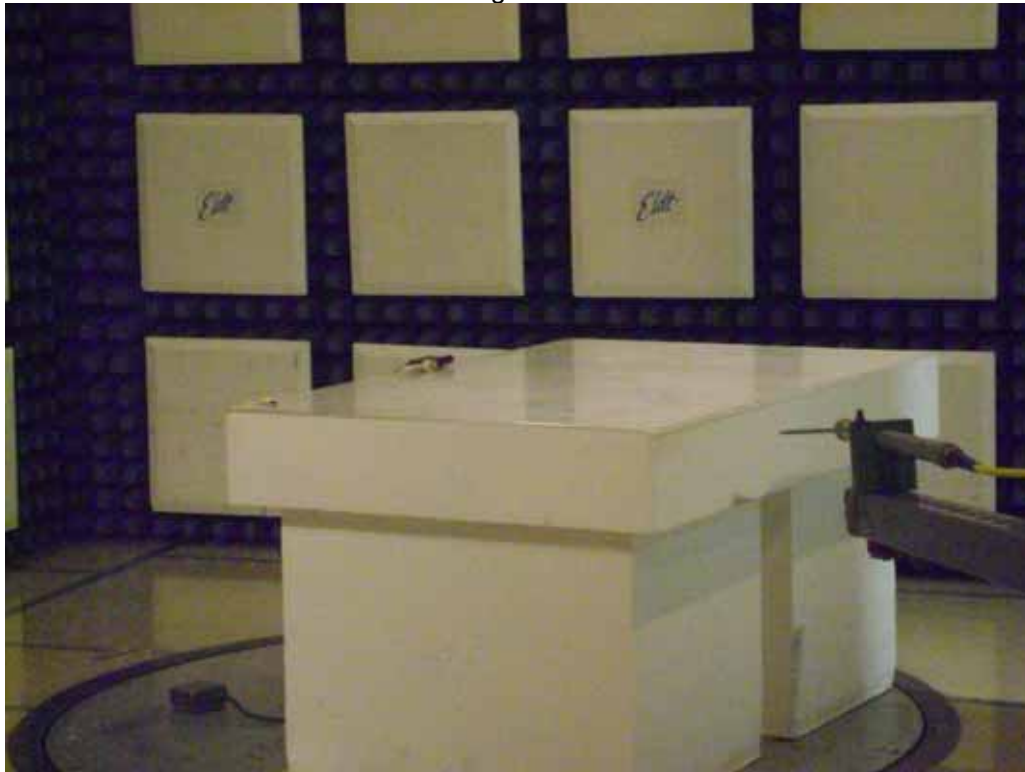
Test Setup for Radiated Emissions – 902MHz to 928MHz, Horizontal Polarization