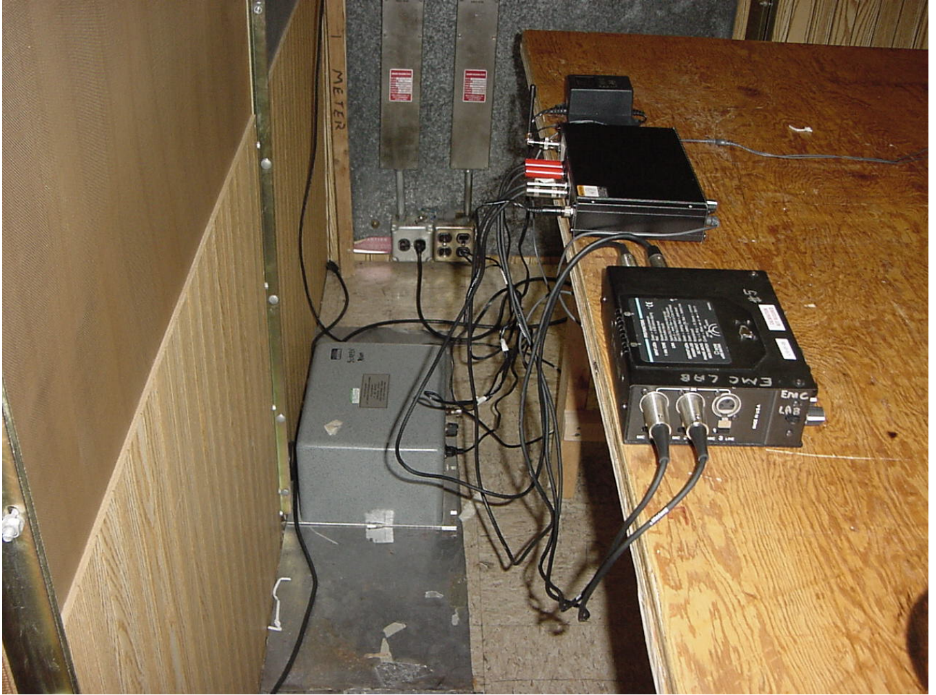
AC LINE CONDUCTED