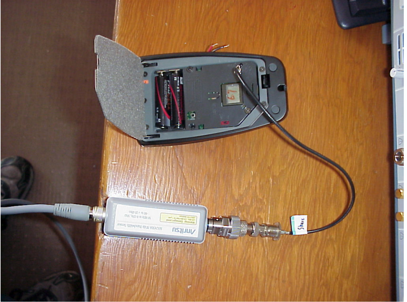
CONDUCTED OUTPUT POWER FCC