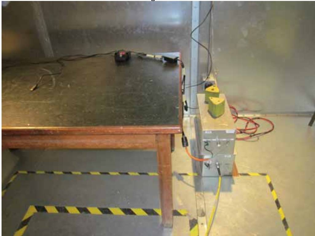
Test Setup for Conducted Emissions