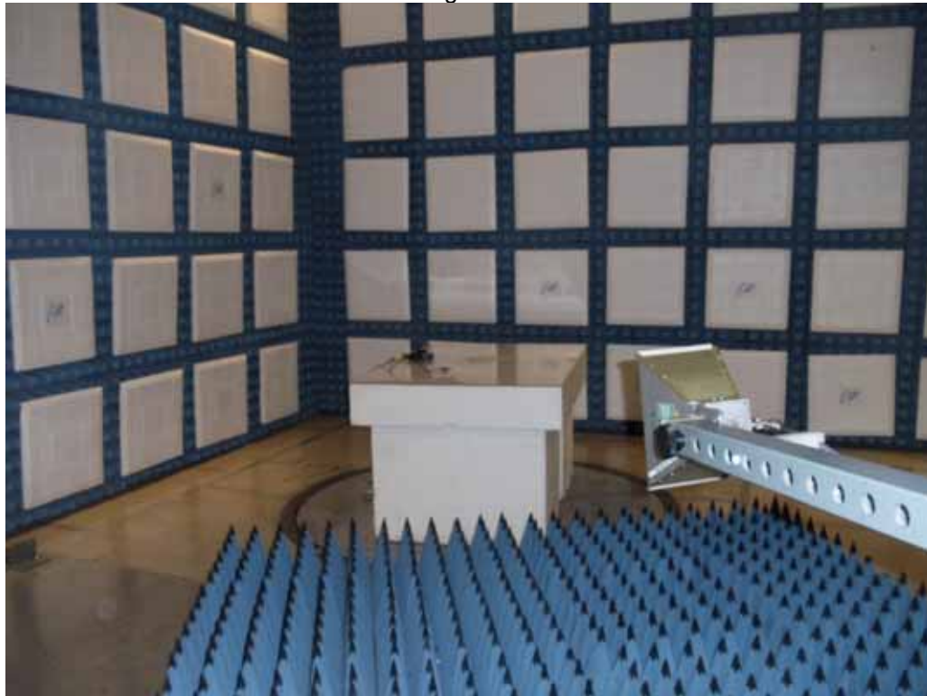
Test Setup for Radiated Emissions – Above 1GHz, Horizontal Polarization