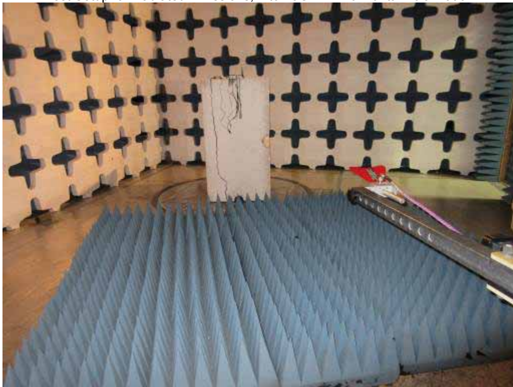
Test Setup for Radiated Emissions, 30MHz to 18GHz – Vertical Polarization