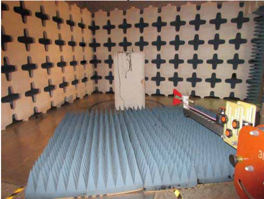
Test Setup for Radiated Emissions, 1 to 18GHz – Horizontal Polarization