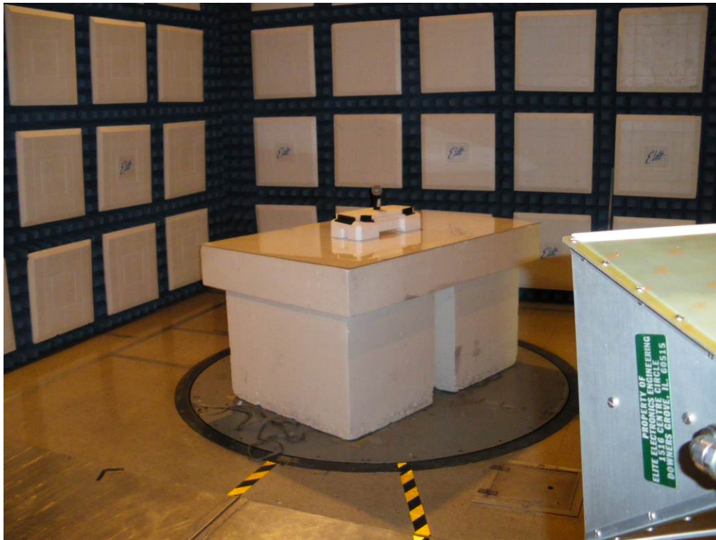
Test Setup for Radiated Emissions, Above 1GHz – Horizontal Polarization