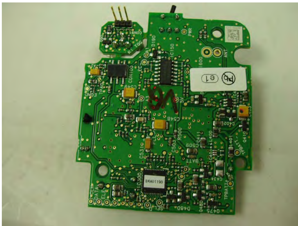
BLX1 PCB Back