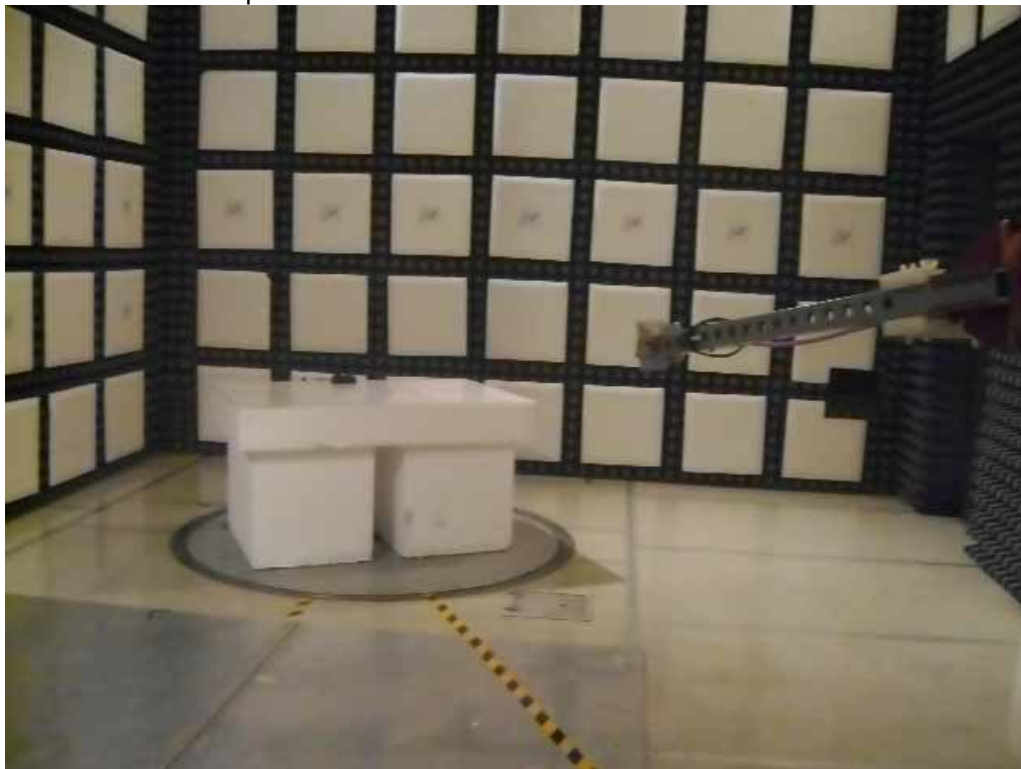
Test Set-up for Radiated Emissions – 2GHz to 18GHz, Vertical Polarization