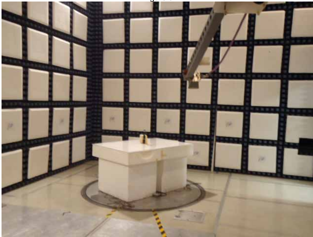
Test Setup for Radiated Emissions – 12GHz to 18GHz, Horizontal Polarization