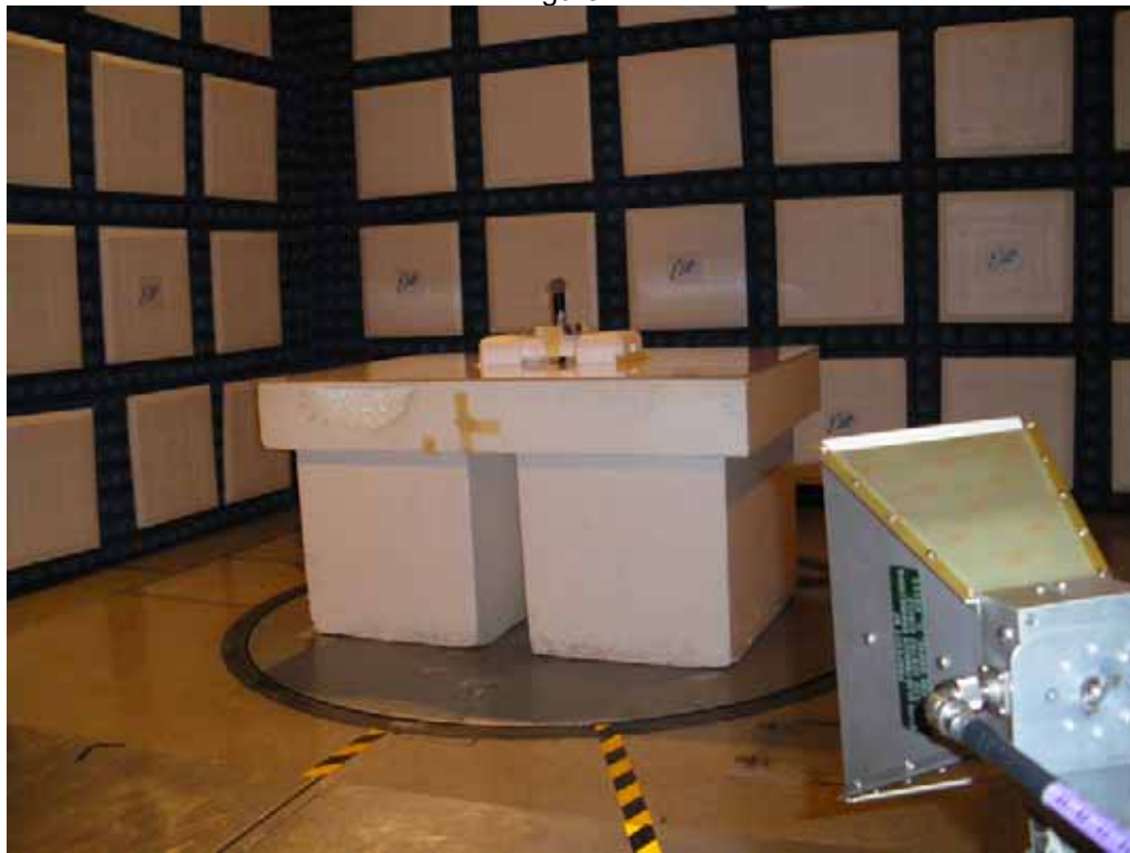
Test Setup for Radiated Emissions – 1GHz to 12GHz, Horizontal Polarization