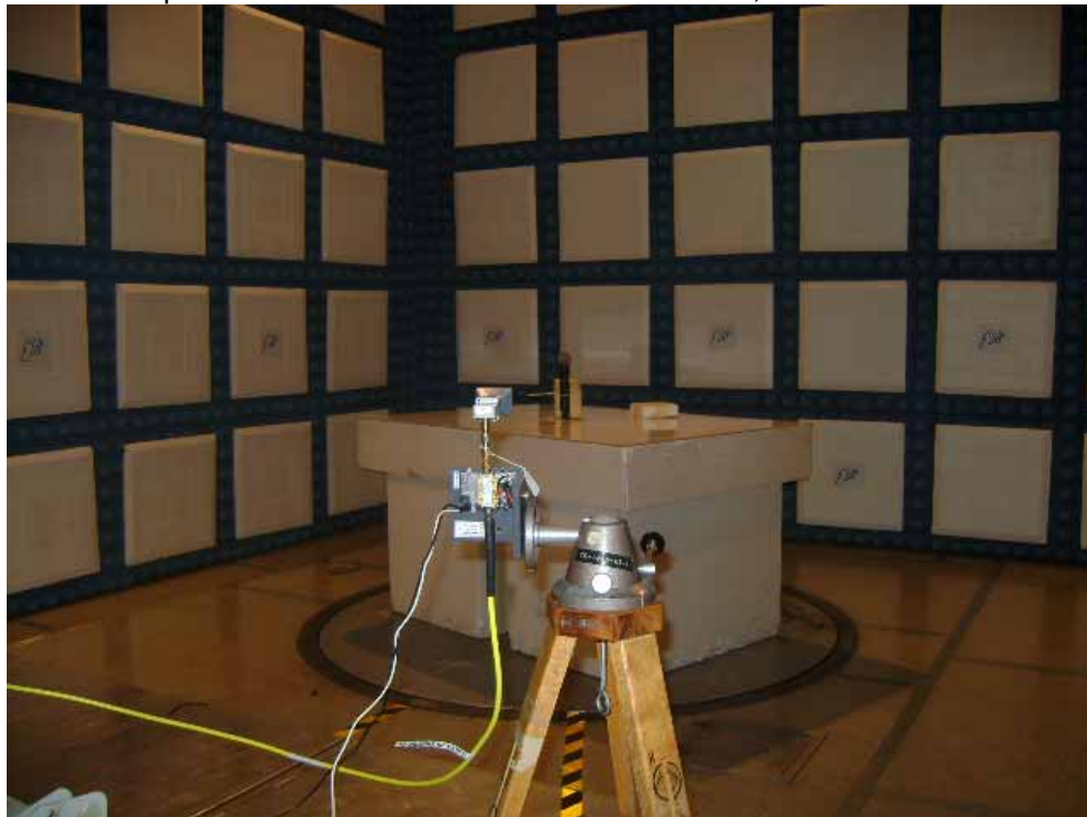
Test Setup for Radiated Emissions – 18GHz to 25GHz, Vertical Polarization