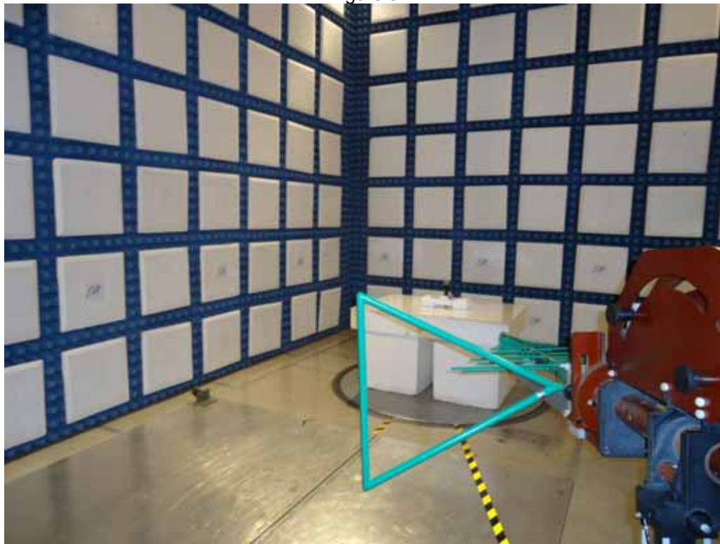
Test Setup for Radiated Emissions – 30MHz to 1GHz, Horizontal Polarization