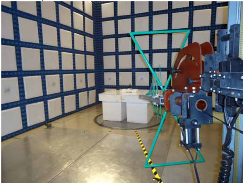
Test Setup for Radiated Emissions – 30MHz to 1GHz, Horizontal Polarization