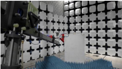
Figure 1: AXT200 Transmitter Test Setup

The plots of the peak preliminary radiated voltage levels and maximized quasi-peak radiated voltage levels results are presented on page 13 thru page 24. The ERP measurements are shown on pages 25 thru page 26. All emissions measured from the EUT were within the ETSI EN 300 422-1 specification limits.