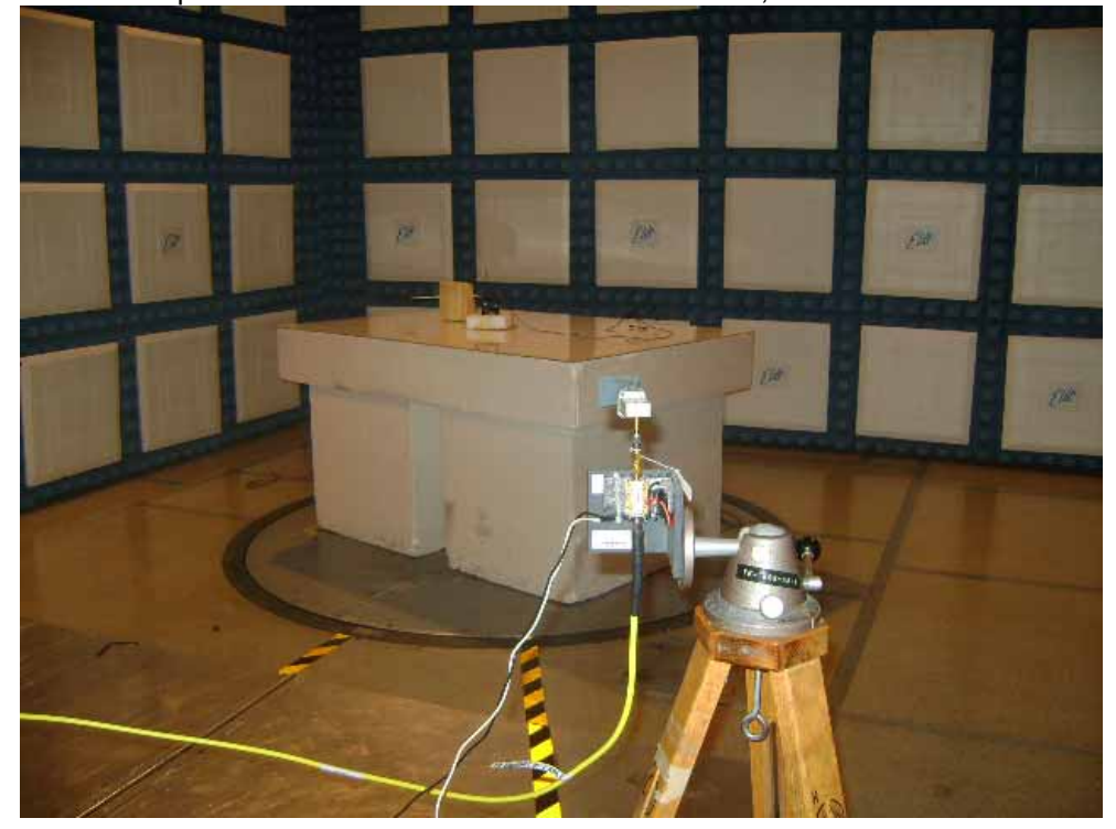
Test Setup for Radiated Emissions – 18GHz to 25GHz, Vertical Polarization