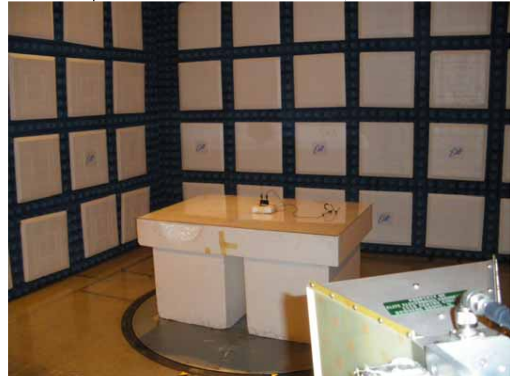
Test Setup for Radiated Emissions – 1GHz to 12GHz, Vertical Polarization