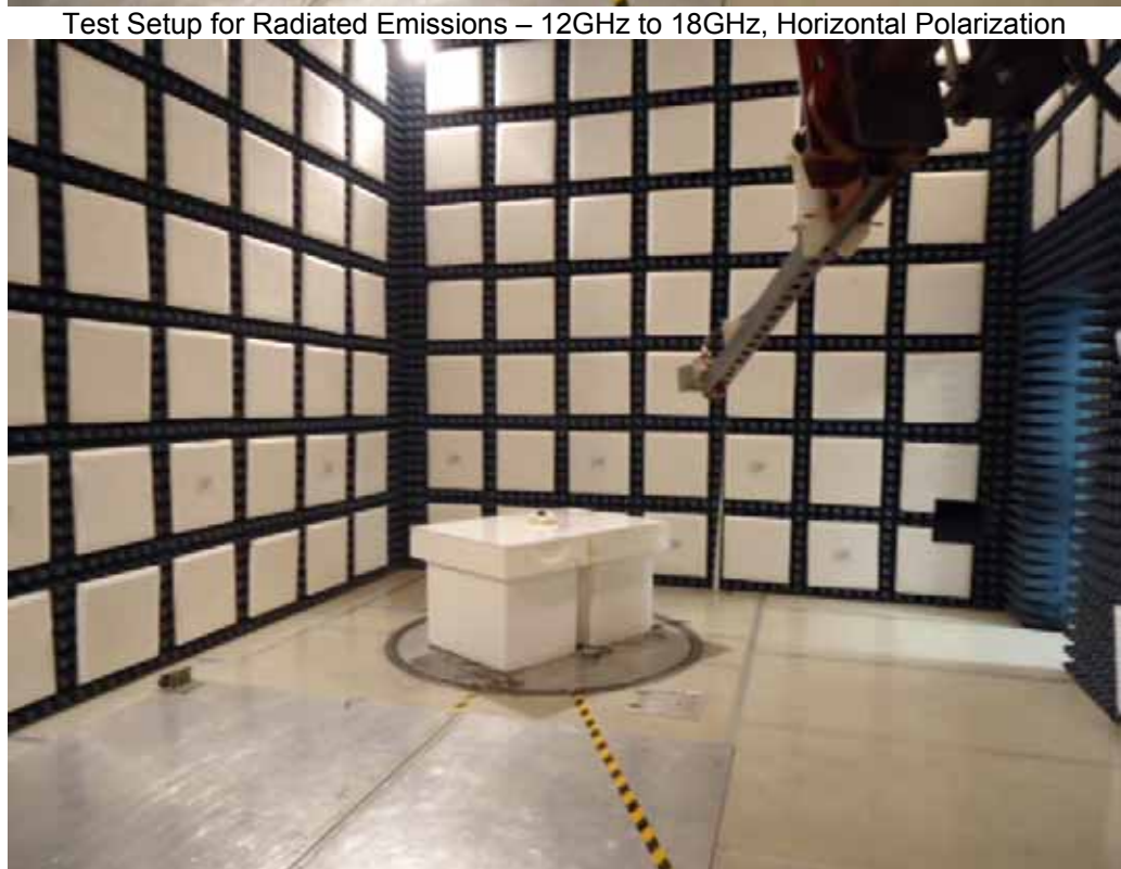
Test Setup for Radiated Emissions – 12GHz to 18GHz, Vertical Polarization