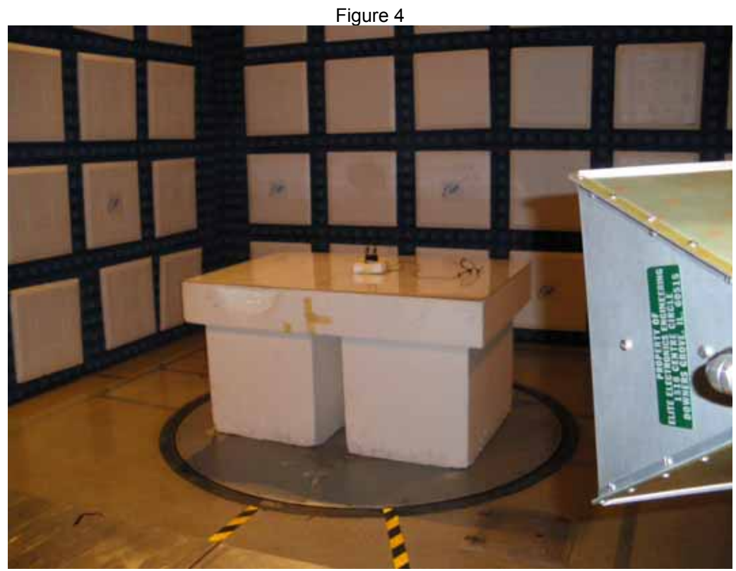
Test Setup for Radiated Emissions – 1GHz to 12GHz, Horizontal Polarization