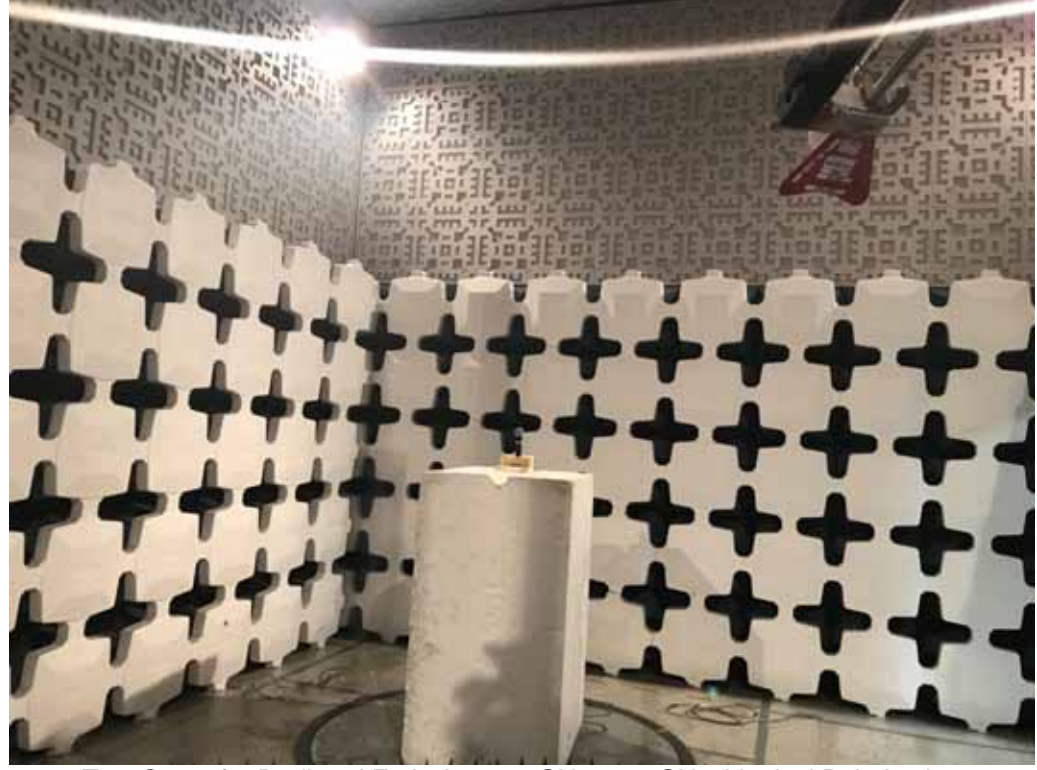
Test Setup for Radiated Emissions – 1GHz to 18GHz, Vertical Polarization