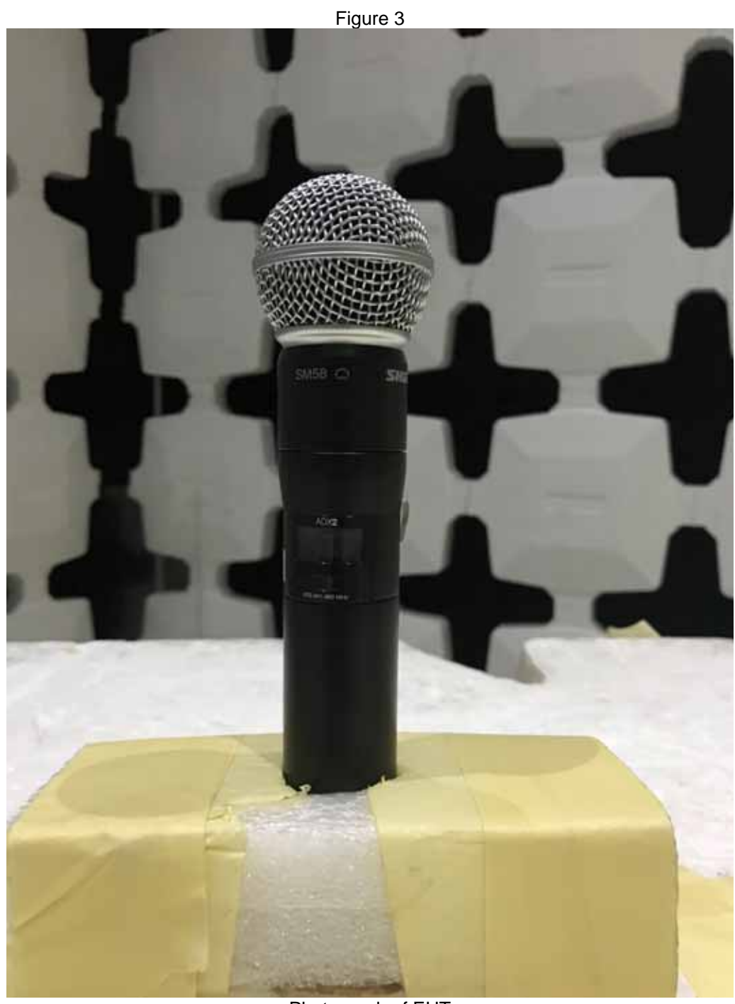
Photograph of EUT