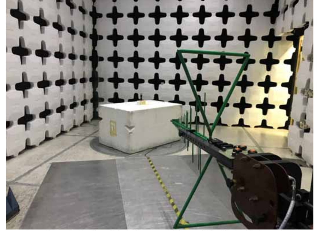
Test Setup for Radiated Emissions – 30MHz to 1GHz, Vertical Polarization