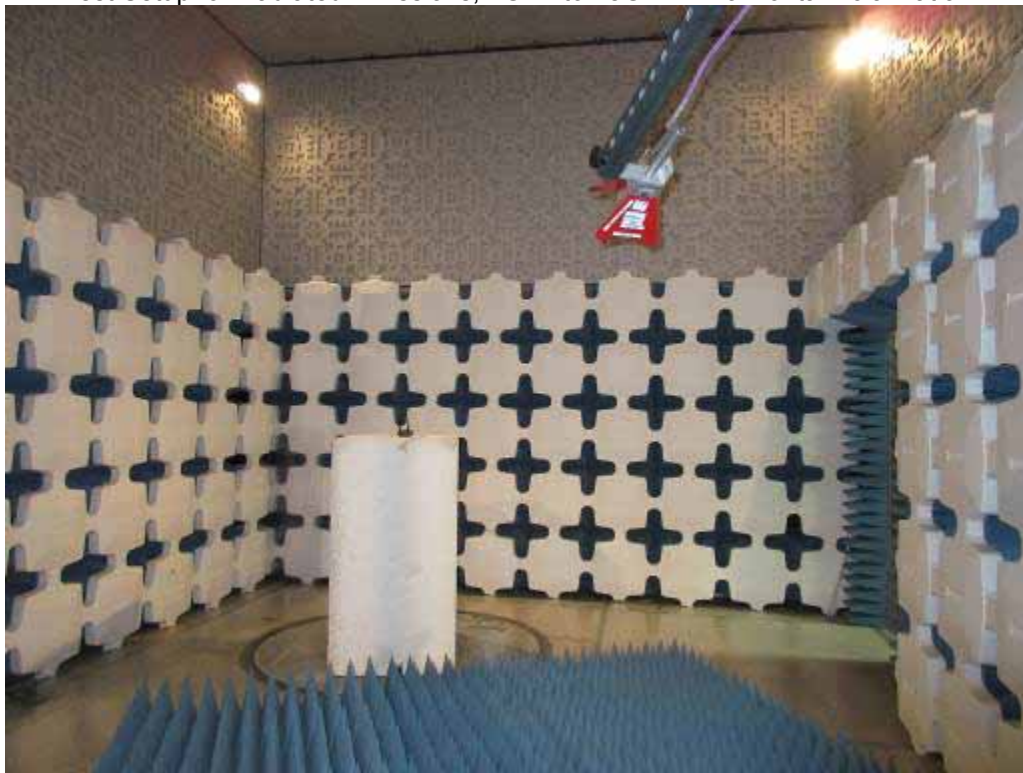
Test Setup for Radiated Emissions, 1GHz to 18GHz – Vertical Polarization