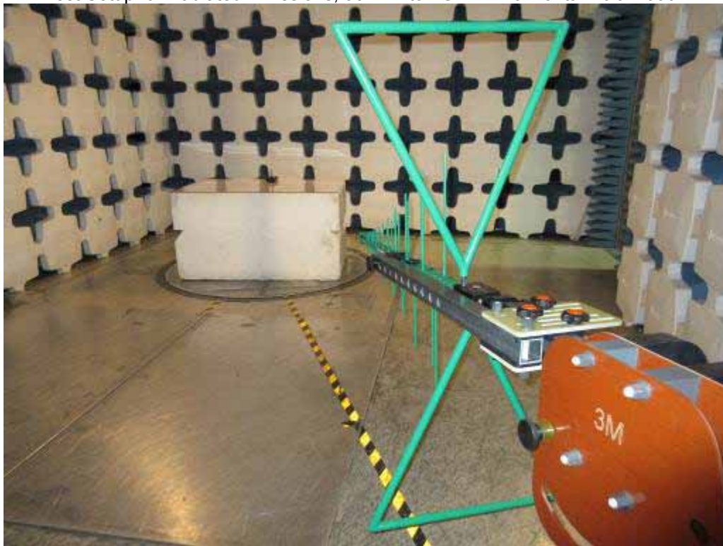
Test Setup for Radiated Emissions, 30MHz to 1GHz – Vertical Polarization