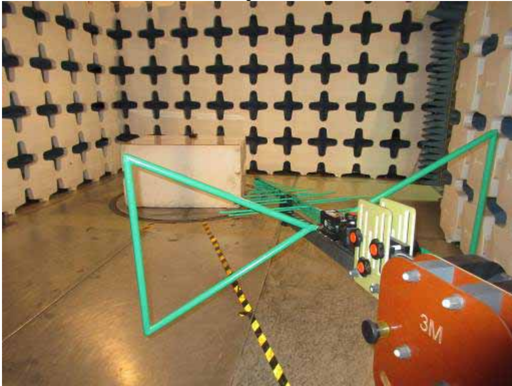
Test Setup for Radiated Emissions, 30MHz to 1GHz – Horizontal Polarization