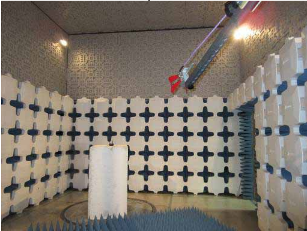
Test Setup for Radiated Emissions, 1GHz to 18GHz – Horizontal Polarization