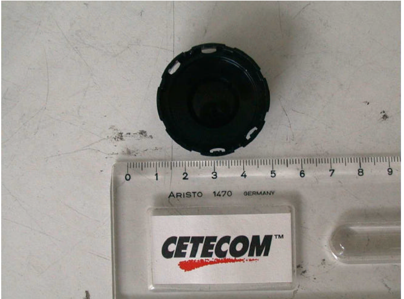
Plastic cover with dielectrical lens