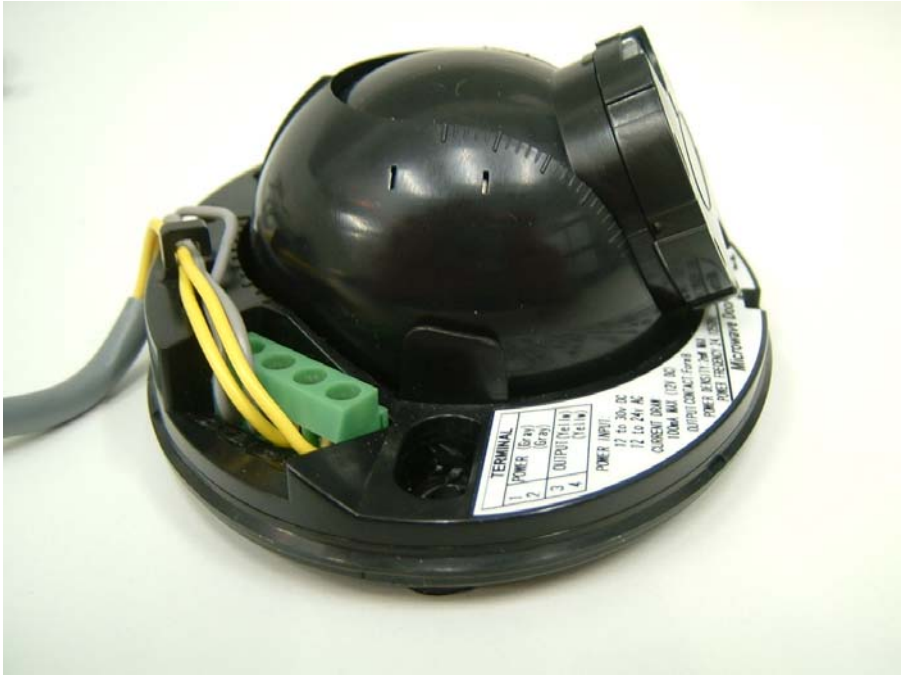
Left Side View without Cover