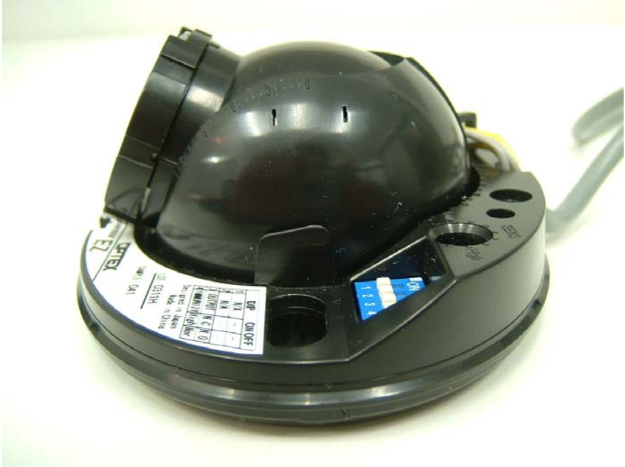
Right Side View without Cover

POWER INPUT: 17 to 30V DC 17 to 24V AC CURRENT 100mA OUTPUT CONTACT FORM POWER RESISTANCE 100Ω MAXIMUM POWER 100mW