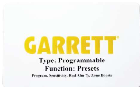
Figure 1 Programmable Card Type

The Garrett Programmable cards have a yellow Garrett logo on the front and the Non-Programmable cards have a grey logo on the front.