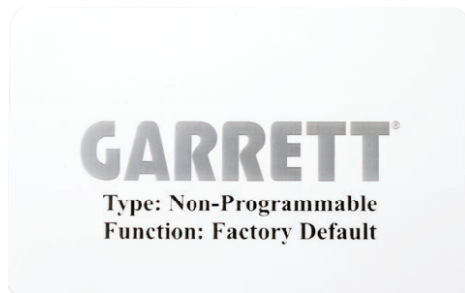
Figure 2 Non-Programmable Card Type