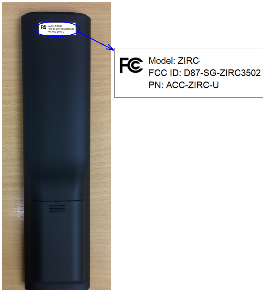
ZIRC-SD3502 FCC ID Label and Location

The WHITE Sticker will be stick onto the back casing of ZIRC as depicted in the diagrams below.