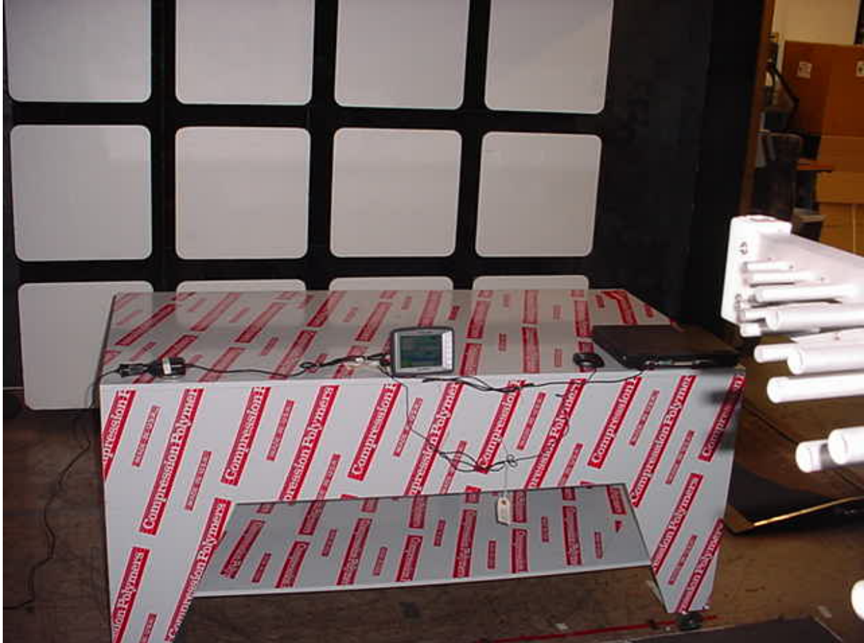
OBW measurements (15.239a).