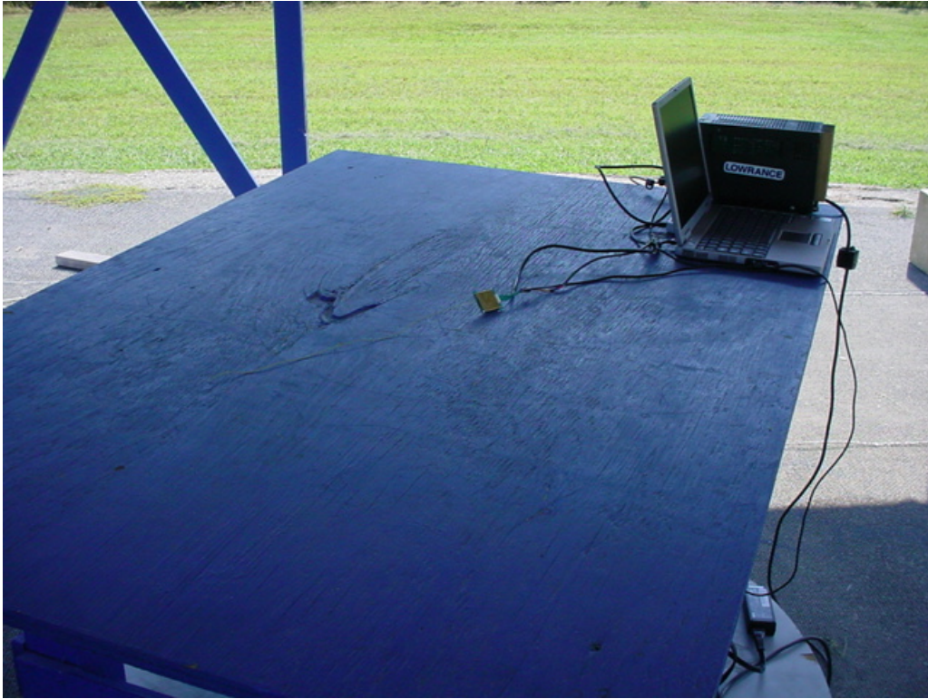
Radiated Emissions at PTI Facility – Front View