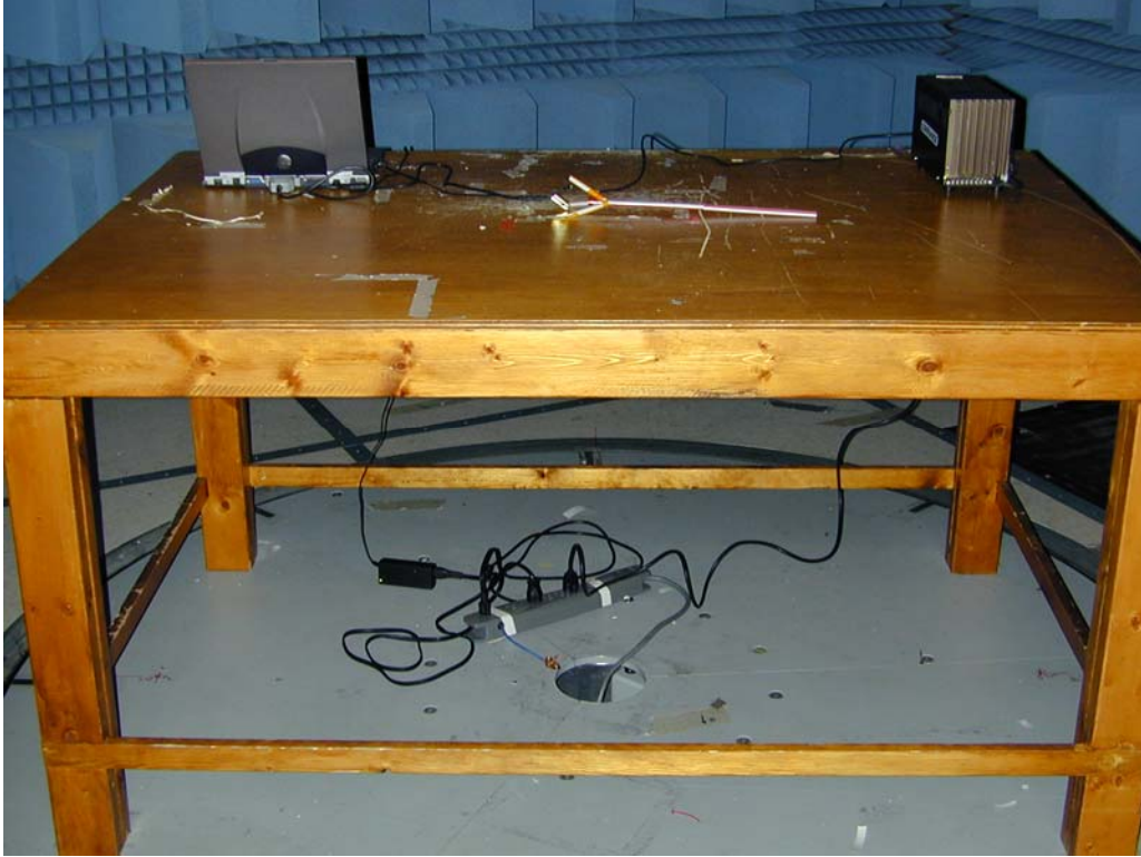
Radiated Emissions at AMD Facility