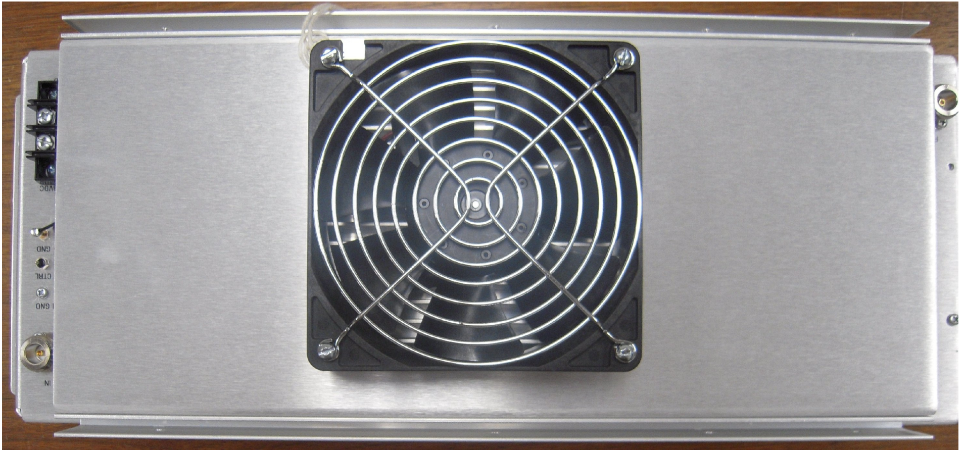
Exterior – Rear