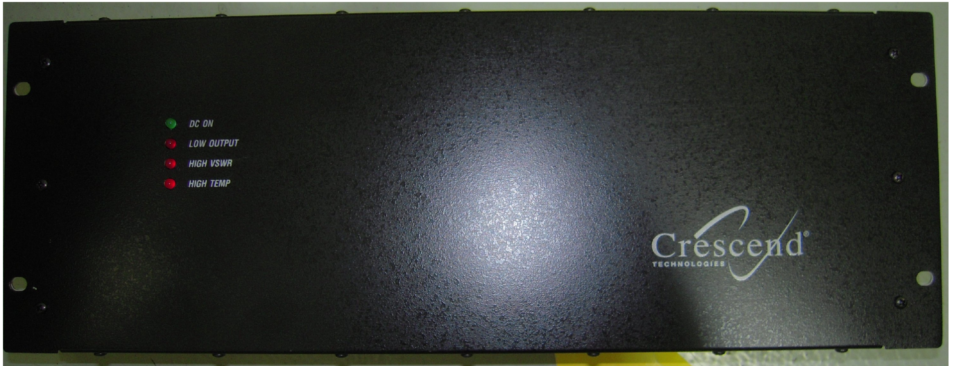
Exterior – Front