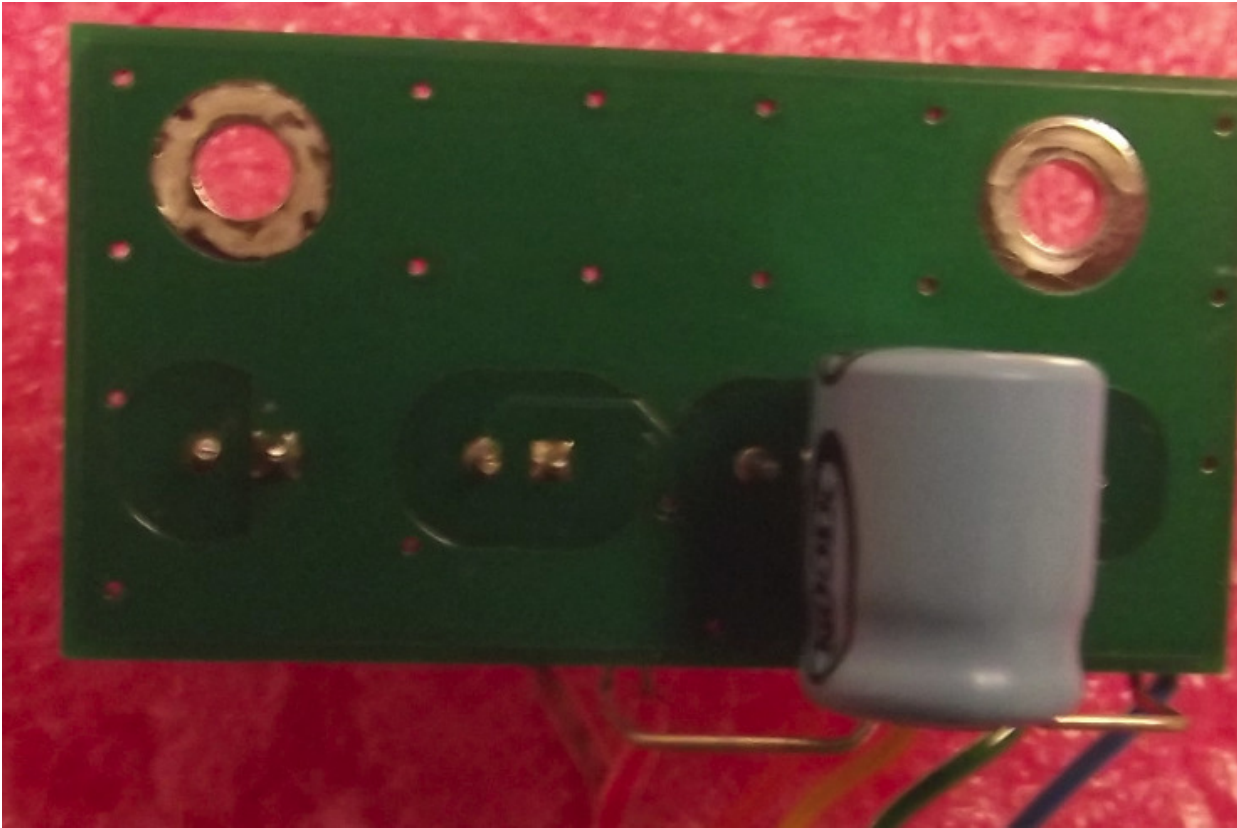
Indicator Board – bottom view