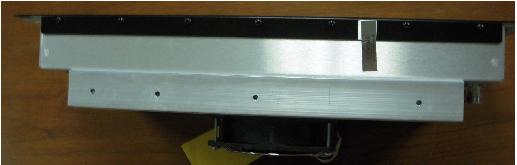
Unit – side view 2