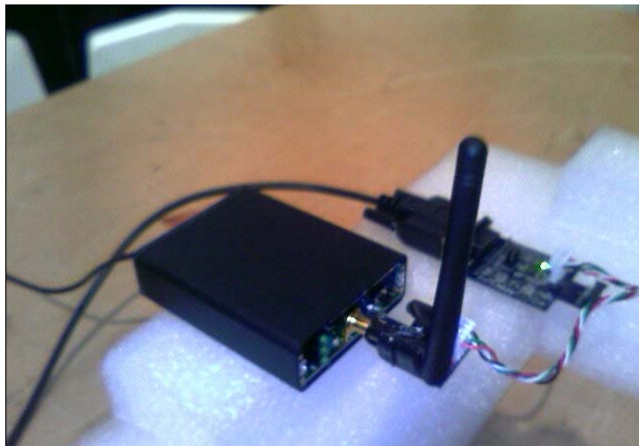
Orientation #1 (Worst-case orientation)