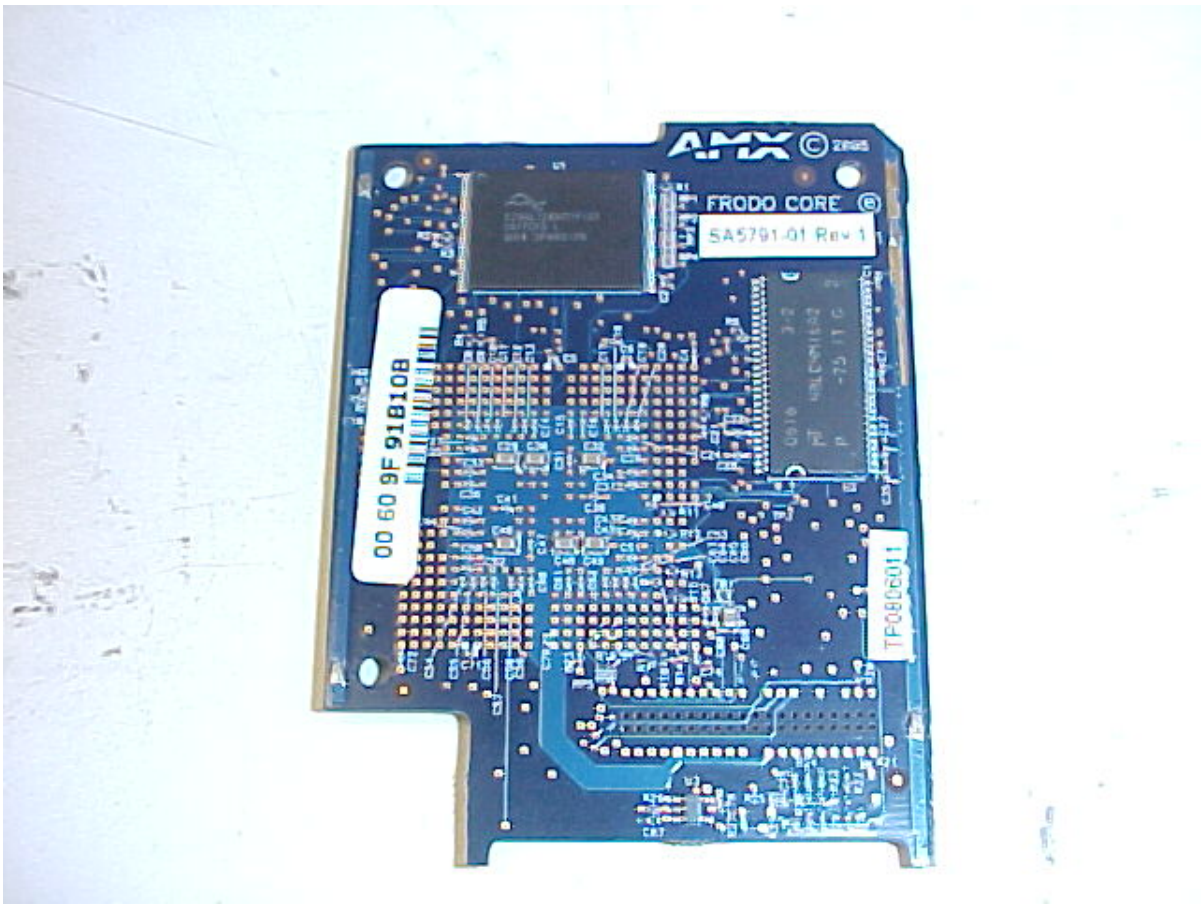
Ethernet Interface Board bottom