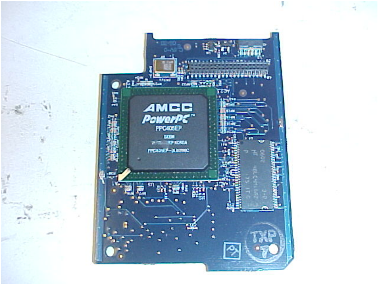
Ethernet Interface Board top