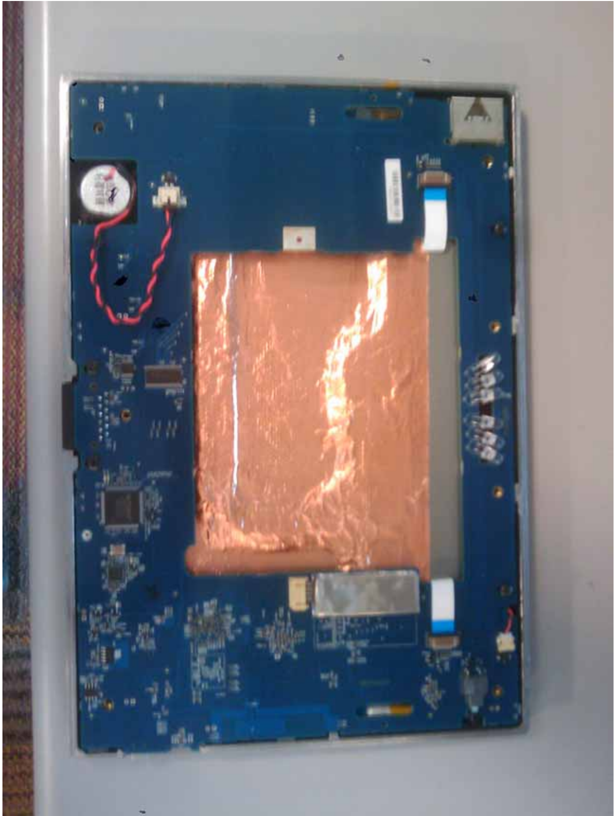
Rear of unit with cover removed showing main board with display board behind it