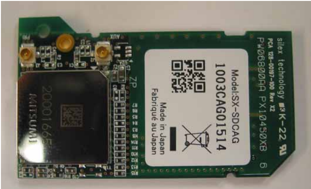
Top and Bottom of WiFi radio card used in the system

This card is a radio module, but FCC modular approval is not being used when installed in the host device.