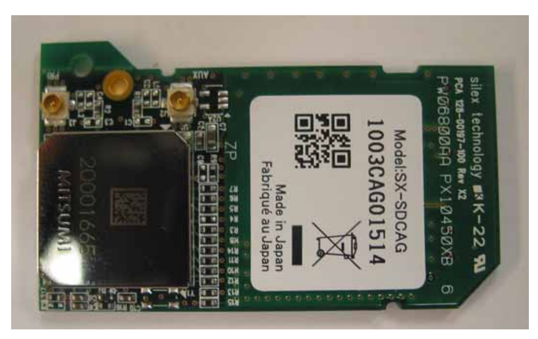
Top and Bottom of WiFi radio card used in the system

This card is a radio module, but FCC modular approval is not being used when installed in the host device.