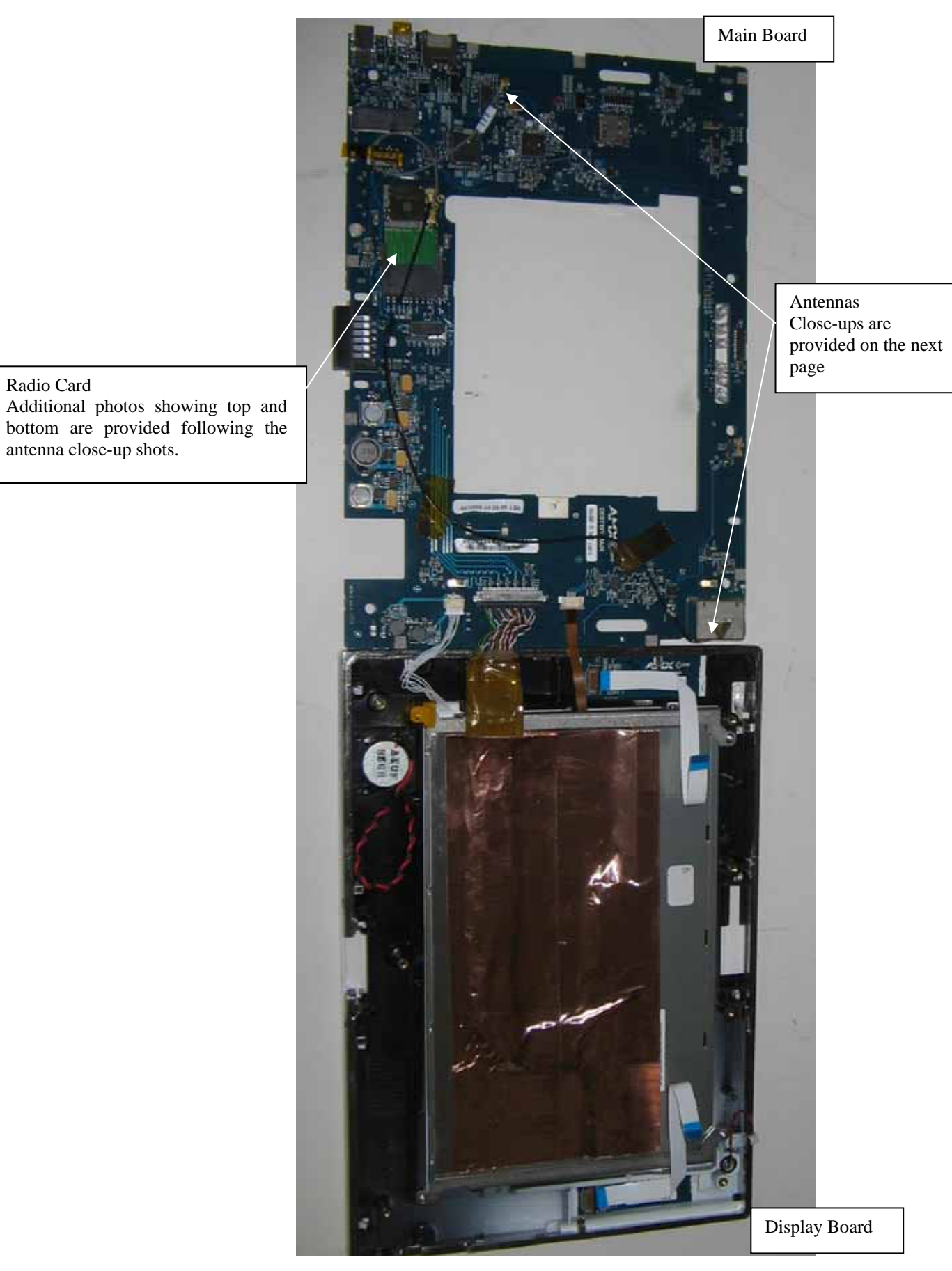
Display and main boards – assembly view