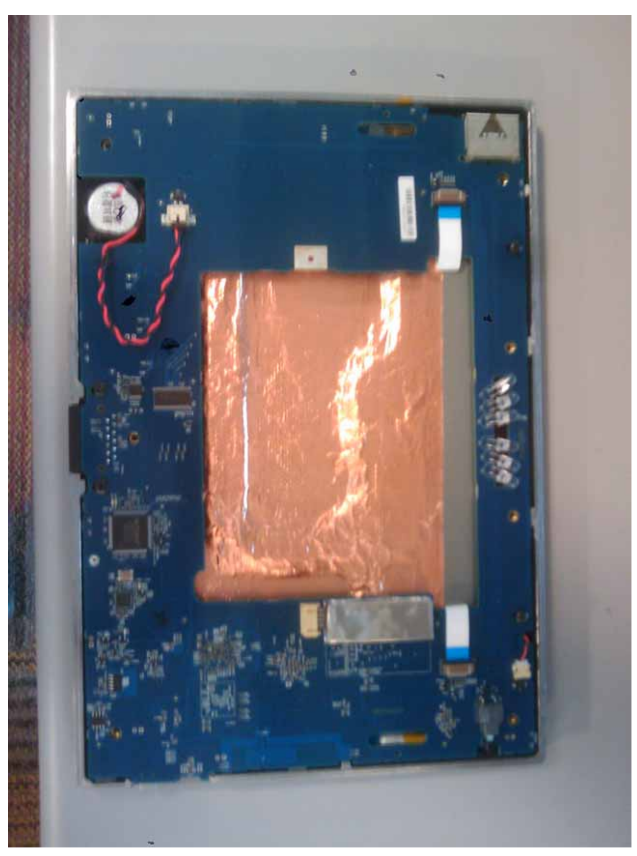
Rear of unit with cover removed showing main board with display board behind it