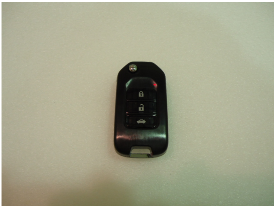
Mechanical Key (folded in)