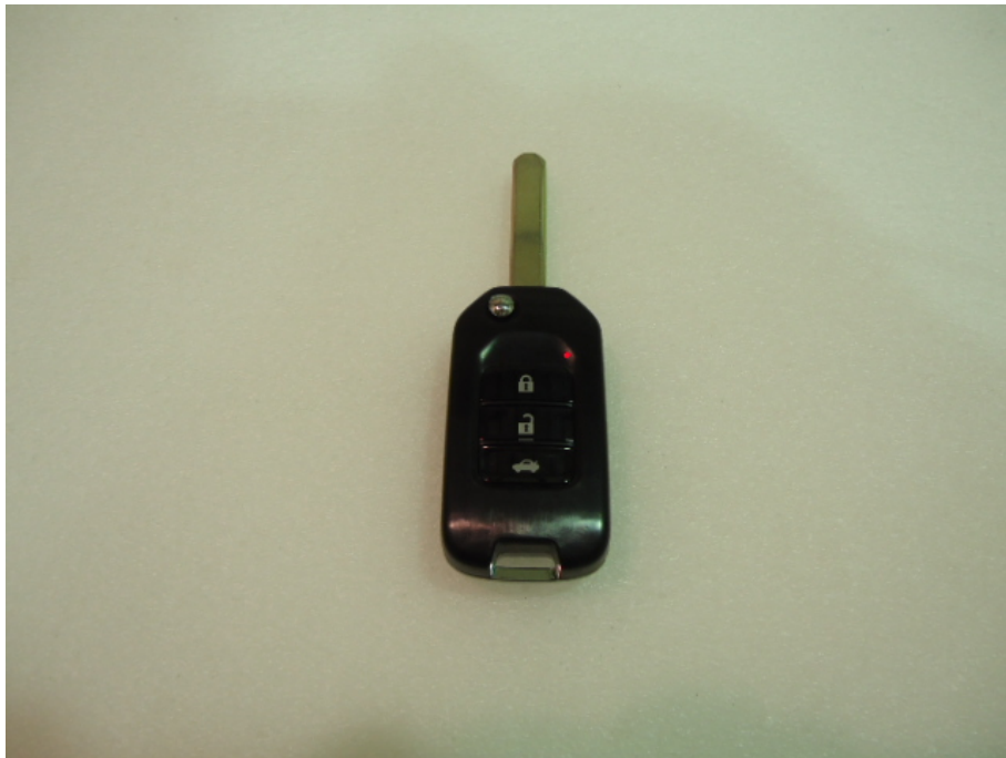
Mechanical Key (folded out) Worst