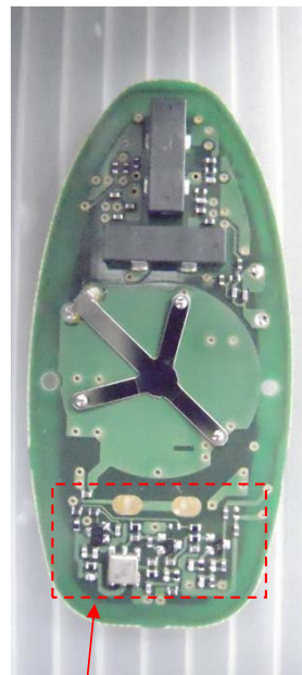
RF Circuit part