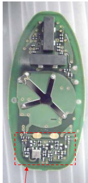
RF Circuit part