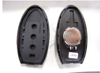
Inside of case