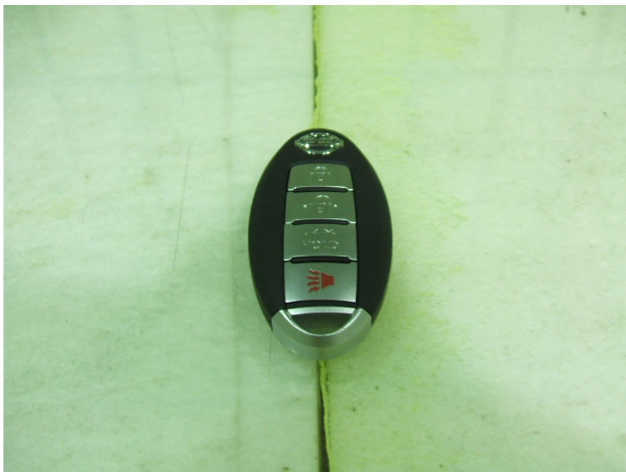
Mechanical Key (Inserted)