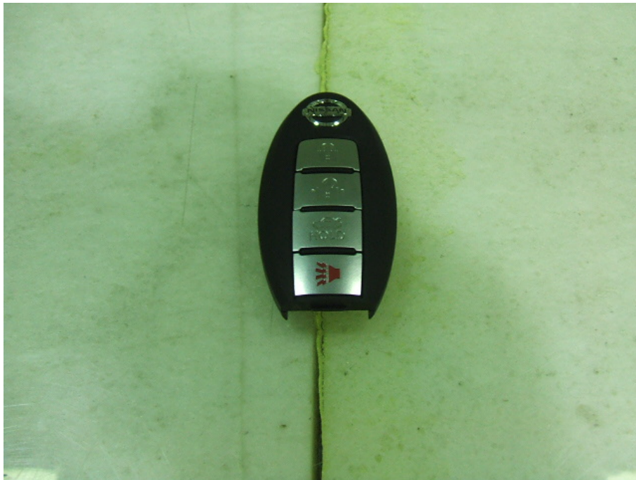
Mechanical Key (Not Inserted) Worst