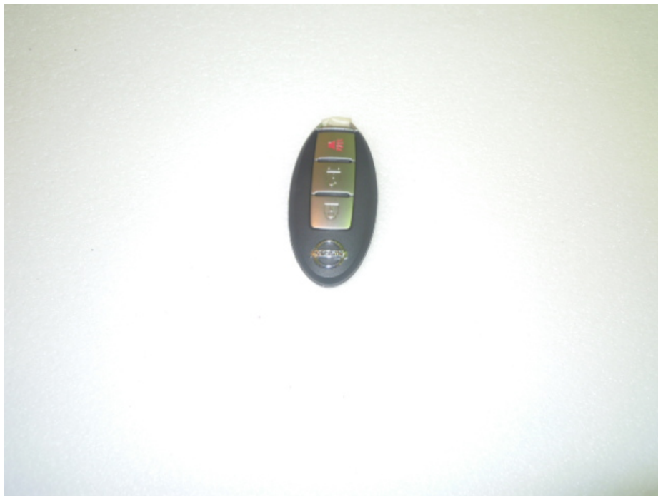
Mechanical Key (Inserted)