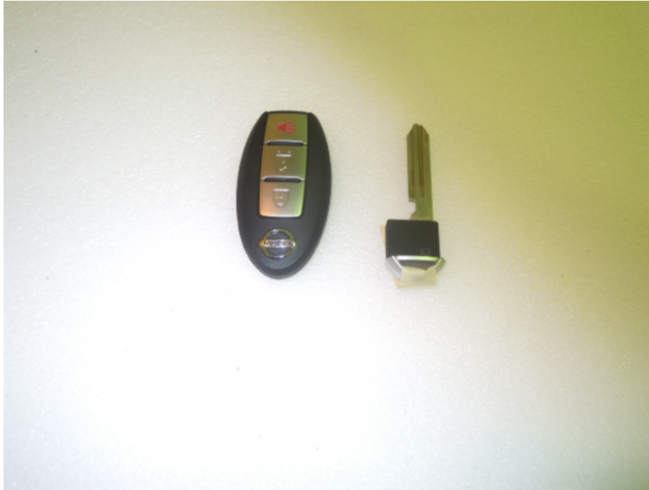
Mechanical Key (Not Inserted) Worst